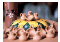
[1], [3] and [4] Chupicuaro ceramics at the Alhóndiga de Granaditas Museum. [2] Tar-covered piggy banks and [5] miniatures from San Luisito neighborhood.

High Temperature Ceramics. Stoneware is a ceramic made with very hard, completely vitrified paste that sometimes contains kaolin and other clays. It is very resistant and when struck, makes a metallic sound. It is also known as high-temperature ceramics since it is fired at a temperature of at least 1,200 degrees Celsius. The color of the paste varies from grays, yellowish white and brown to reds, depending on their components. In different parts of Mexico, indigenous and mestizo communities as well as some artisans and independent artists produce this kind of ceramics, making with it vases, boxes, decorative plates and ashtrays. This kind of ceramics is made in places like La Soledad neighborhood in Acámbaro.