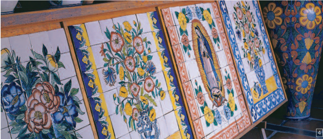
Tiles by Alfredo Carrillo. Dolores Hidalgo.

best porcelain produced in New Spain and newly independent Mexico. In Guanajuato, many specific refinements were added, and a regional tradition arose that is still carried on by some ceramicists today. Majolica ware uses enamel that may have been created in pre-Islamic Egypt and was used extensively in ninth-century Baghdad. It was an attempt to achieve a white porcelain similar to the kind made in China, covering the paste—a reddish or yellowish white clay mixture—with a white color made from the tin.