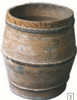
Pulque barril. Mestizo pottery.