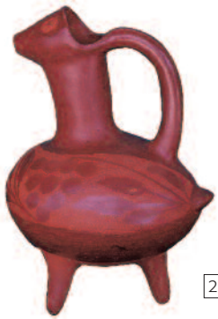
Vessel in the shape of a duck. Mestizo pottery.