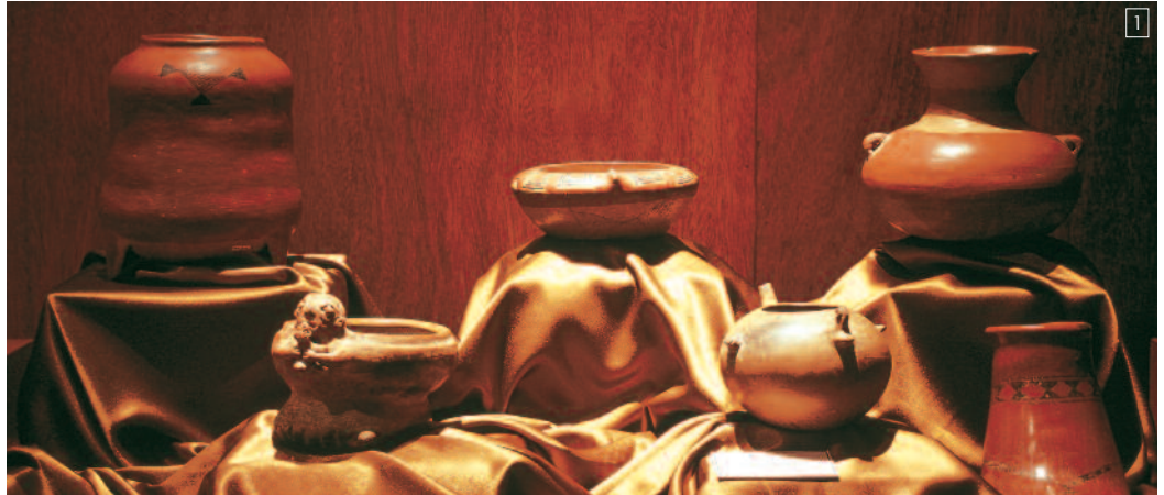
Chupicuaro ceramics in the Alhóndiga de Granaditas Museum.