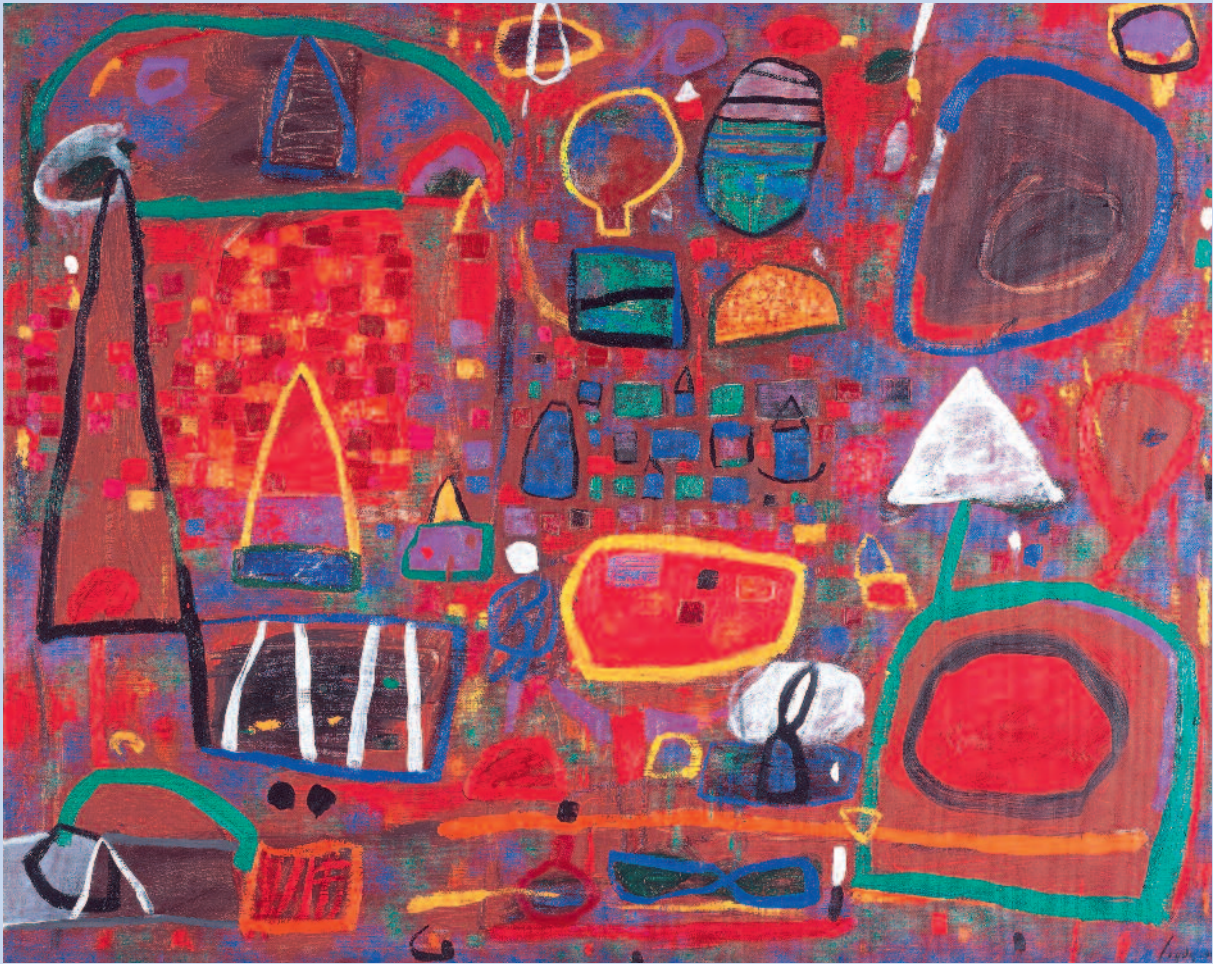
▲ Traces of the Soul , 80 x 100 cm, 2000 (oil on linen).

happily —and here we have Leyva as an example— art does not need to strengthen its present in the sources of a primitive or magical past. In Latin America those sources are running waters that flow nonstop everywhere. This cohabitation of all time periods is our wealth, never our handicap. We do not need to discover what surrounds us every day. It is sufficient to show it, to make it a presence. And since aesthetically speaking, the dialectic of before and after does not exist for us, neither does the dialectic of outside and inside, that boundary imposed by the frontier between the objective and the subjective. Latin American art does not need to look to any past: it is sufficient for it to open its eyes and see. That