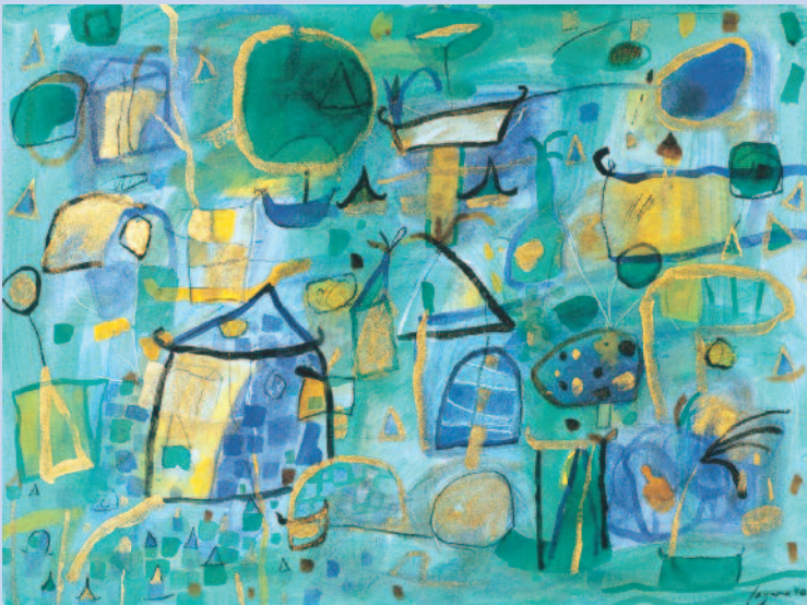
▲ On the Silk Route , 57 x 76 cm, 1998 (ink on paper).