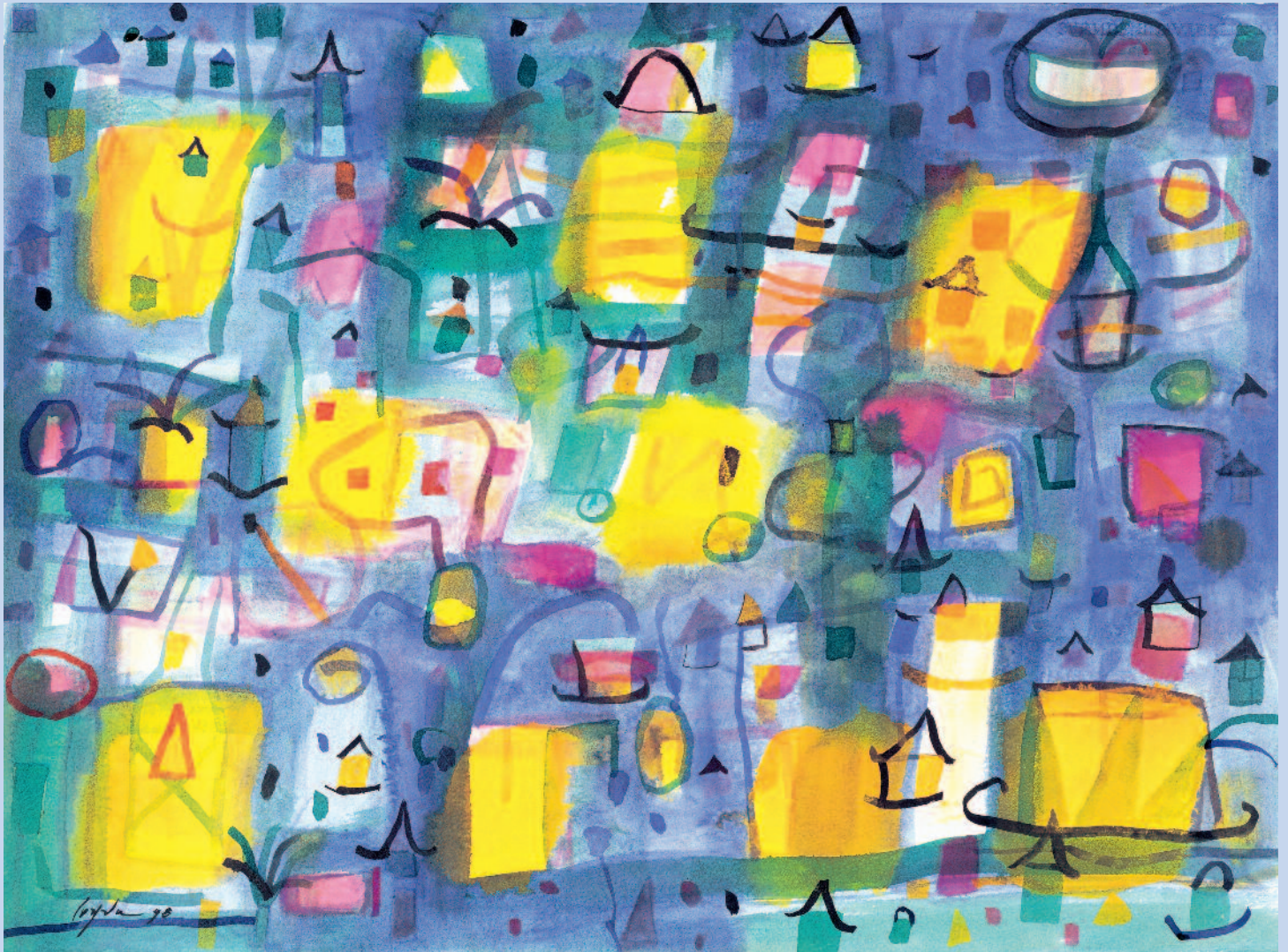
▲ Beneath the Waters , 57 x 76 cm, 1998 (ink on paper).

What we discover in Leyva's painting are the sketches of a forgotten, happy world.