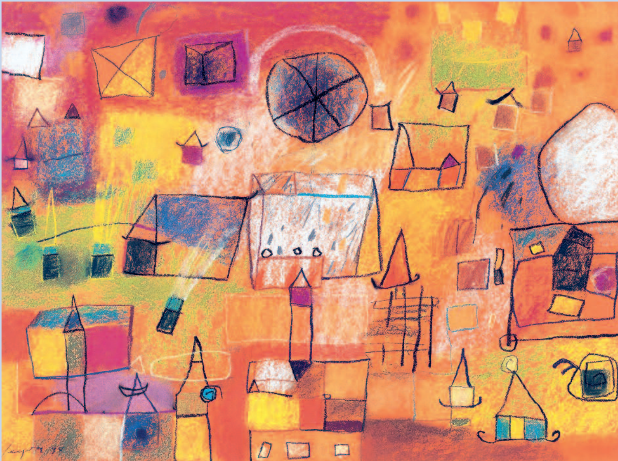
▲ Lands of the Countryside , 55 x 75 cm, 1998 (pastels on paper).

The postmodern age is founded on bringing forms which have been consistent in other times and now irrupt before us with an astonishing fascination up to date again.