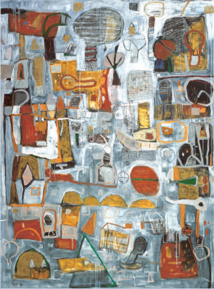
▲ Arcanum , 200 x 150 cm, 1998 (oil on linen).