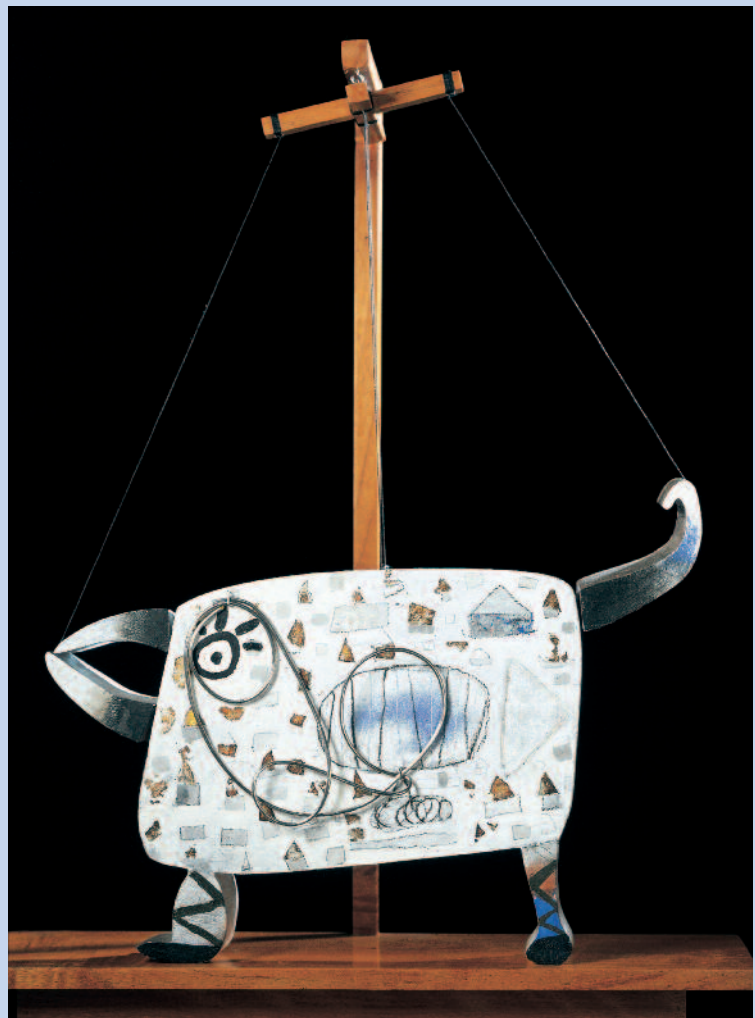
▲ The Tenacious Beetle , 35 x 39 x 7 cm, 2000 (mixed media on wood [puppet]).