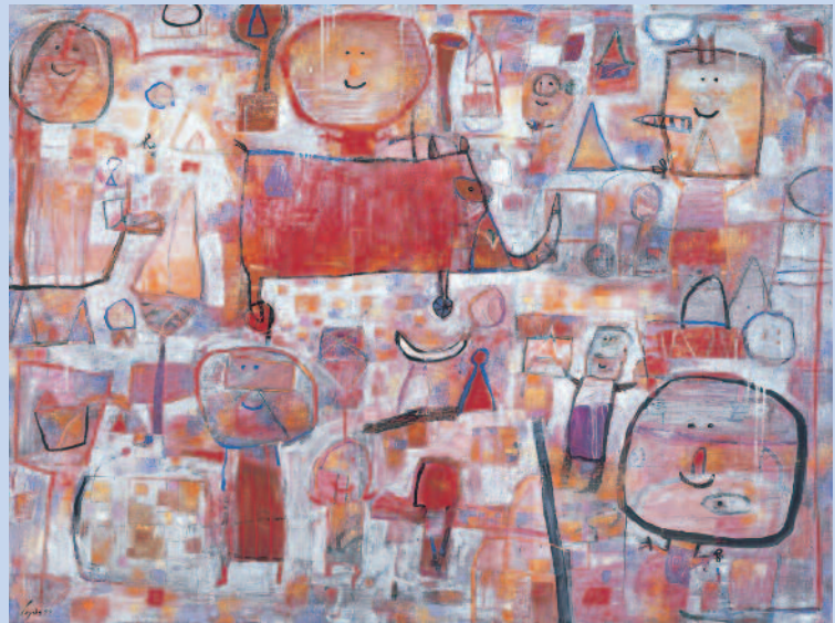
▲ We, You and They , 150 x 200 cm, 1999 (oil on linen).

The European gaze. Europe literally "turned its eye" to a still idyllic exterior, trying to overlook its responsibility given the "primitivism" of those peoples removed, as a collective possibility, from the overwhelming impulse of the myth of progress. As is well known, that change in Europe's gaze situated those objects outside of time, in this case out of "European time", avid for new objects and fed up with novelties invented at the last minute. What European artists did with that richness abandoned because of velocity is another story. But what really concerns us is that all that object-ness implies an imagery needed by the civilization of progress. They are sources for it. In Latin America,