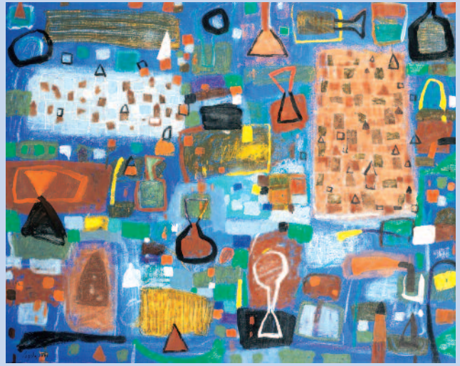
▲ Where Dreams Boarded , 80 x 100 cm, 2001 (oil on linen).

The postmodern age is founded on bringing forms which have been consistent in other times and now irrupt before us with an astonishing fascination up to date again.