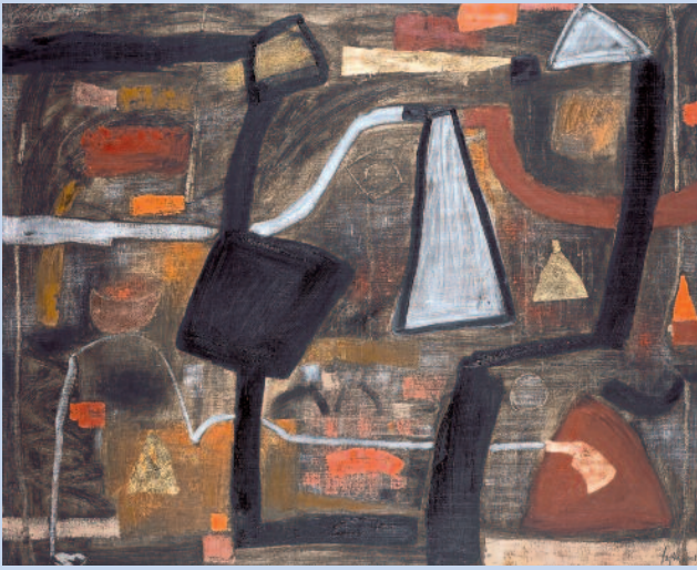
▲ Signs of the Middle Ages , 80 x 100 cm, 2001 (oil on linen).