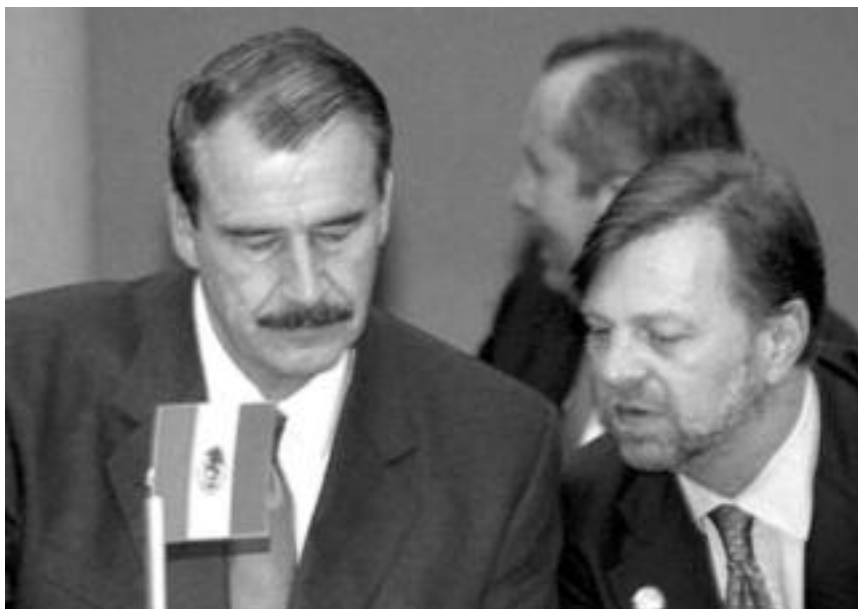
With President Vicente Fox.

gone profound changes in recent decades. Principles do not disappear; they evolve. States have decided to cede sovereignty in many fields of action, both for the common good and in their own interests. The universal trend of favoring the protection of individuals over the protection of states has in fact reduced the breadth of those principles. This positive evolution has been the result of continuing international negotiations and is rooted in commonly accepted legal norms we would