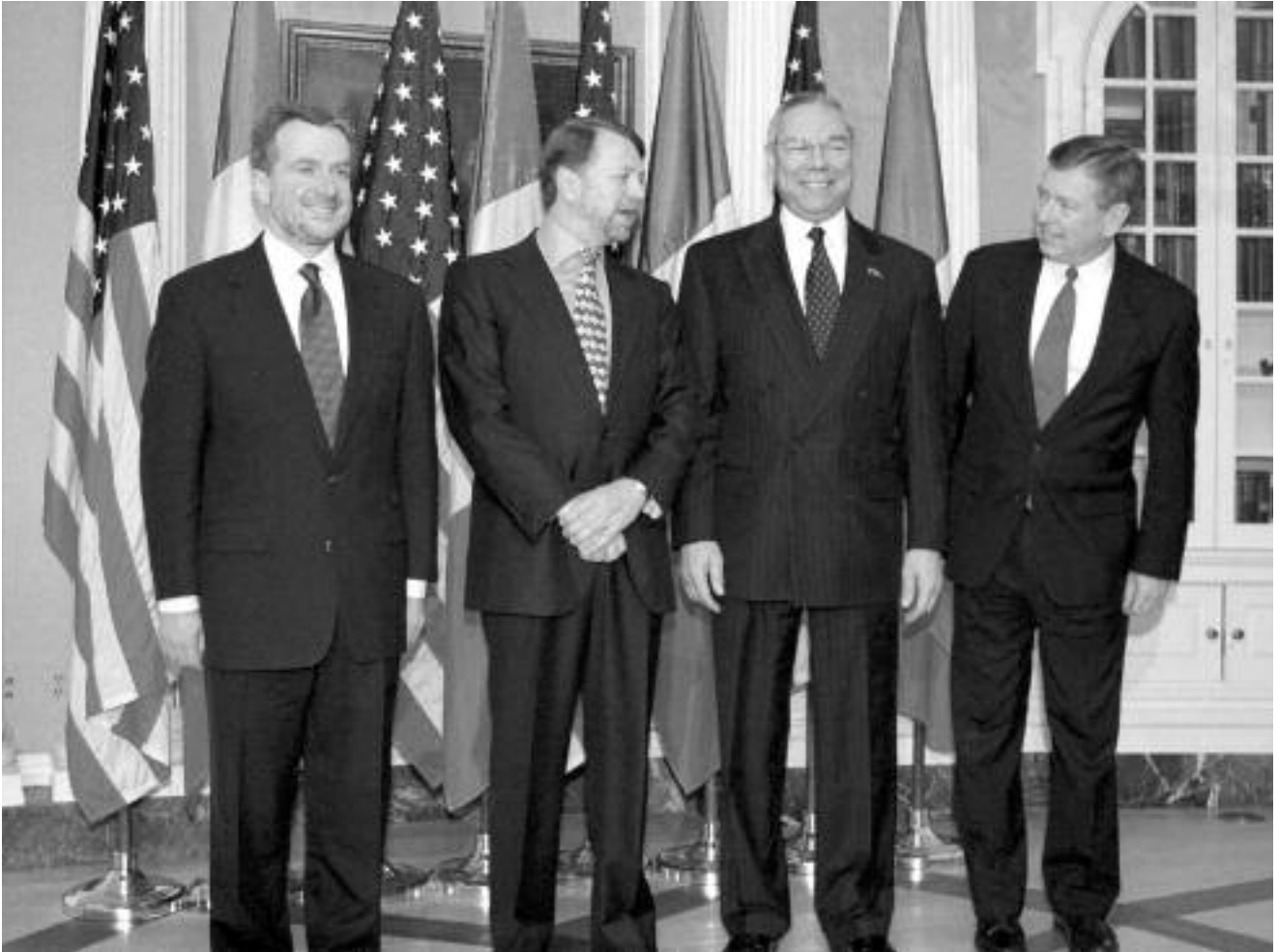
Castañeda with other U.S. and Mexican cabinet members at the White House.

ly serve its interests and —it should be recognized— may sometimes affect the interests or rights of other nations (I have already referred to some important examples, like the Kyoto Protocol or the Statute of Rome). Additionally, due to the tragic events of September 11, the United States has focused its foreign policy more on regions and issues specifically linked to the fight against terrorism and, as a result, seems to be paying less attention to Latin America. Nevertheless, Mexico and the United States continue to exchange points of view about the situation in the region, as in the cases of Colombia, Venezuela and Argentina. These discussions are very constructive, for they help strength-