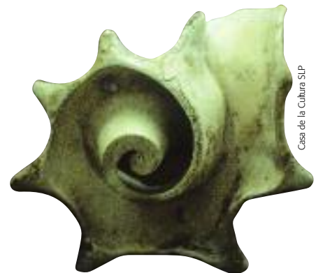
▲ Cut shell pectoral showing Eheilacocoxcatl, the symbol of Ehécatl, the God of the Wind.

three and even four harvests a year, although cultivation did not benefit from any but the aid of the elements or instruments other than rough stakes.” 3 Until now there has been no evidence of intensive agricultural techniques, but they were outstanding producers of corn, cotton, beans, squash and a broad variety of chili peppers. They caught many species —dry fish, shrimp and skate eggs— in the lagoons and rivers that they salted and sun dried. They used salt not only as a condiment, but also for medicinal purposes. In the sixteenth century, Richard Hakluyt emphasized the importance the Huastecs gave it, writing,