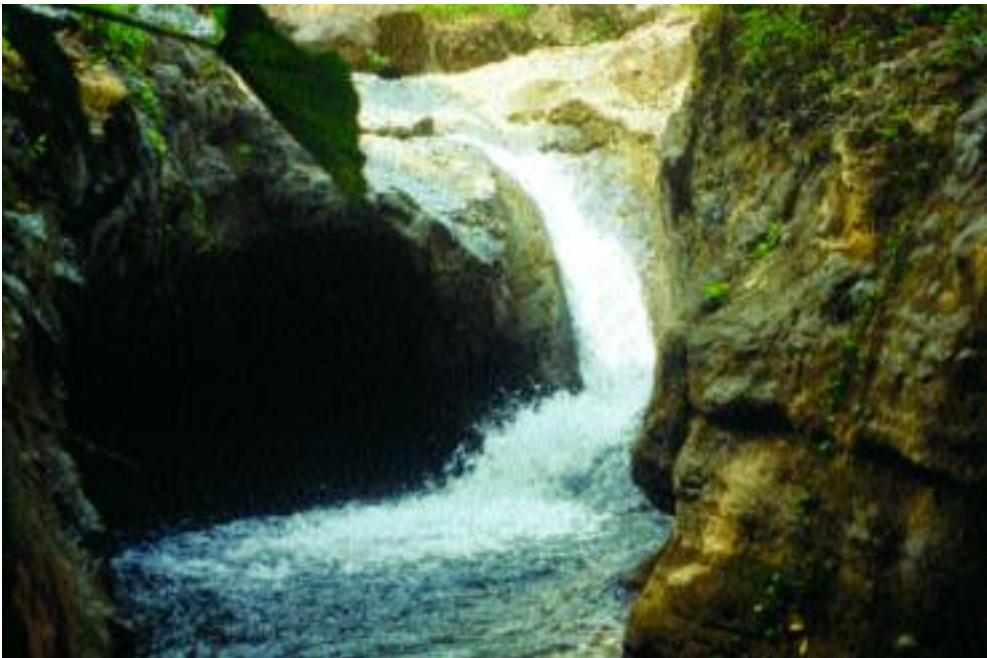
▲ The Otontepec Mountains in Citlaltépetl, Veracruz.

The Huastecs, considered themselves "the people of the deer", descendents of Mixcóatl.