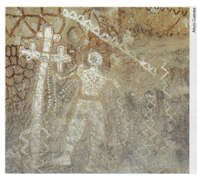
Cave of the Figures. The cross shows the influence of Catholicism in the indigenous world view

Toward the west, in an open area, is La Angostura, relatively close to Casas Grandes, from which the Paquimé style must have influenced its rock paintings. The rocks engraved at this site are on the side of a small rise. They sport abstract fig-