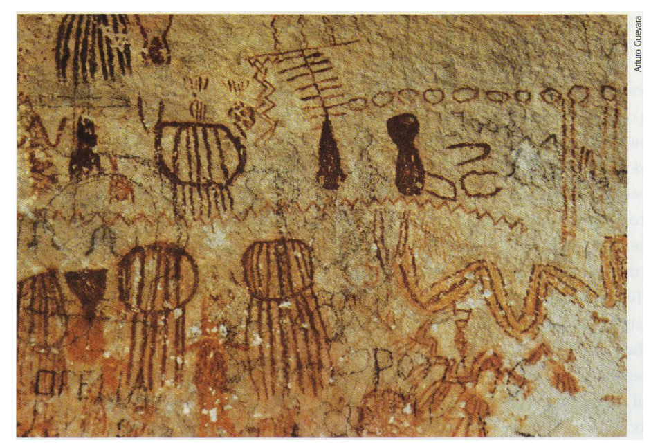
Cave of the Figures. The paintings are attributed to the Concho

In Chihuahua, decorated caves and rocky places abound and are, for the most part, simple: a hunter who decided to etch a figure because the gods asked him to, or an indigenous group that left a lasting testimony of their petitions to the gods. However, there are complex works, such as at the Piedra de las Monas (the Stone of the Figures) in central Chihuahua, which includes the aforementioned abstract figures and a group of dancers wearing large hats. It probably represents a dance of the Concho group (that the Europeans called Mitotes ), petitioning the gods, celebrating a victory or preparing for a dangerous undertaking. The ritual usually included the consumption of peyote. The hats are an indication of European influence.