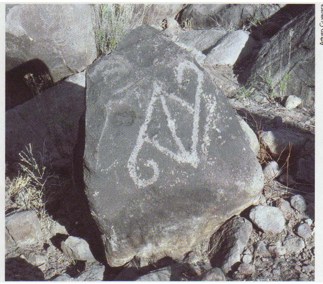
La Angostura. Abstract design that shows the influence of the Paquimé culture.