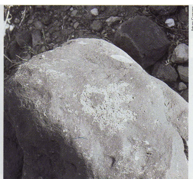
La Angostura. The drawing seems to be the image of a comet.

ures, squares, triangles and a kind of horizontal S that seems to represent a column of smoke or steam. Also present are sunrises, stylized serpents and other religious representations like the effigy of a deer that seems to be drinking water and has a flower between its horns. This is a deer sacred in the North of Mexico, still worshipped among the Huichol. Among the figures associated with ideology are the dancers wearing animal horns, one of which is adorned in the style of the cultures of the U.S. Southwest.