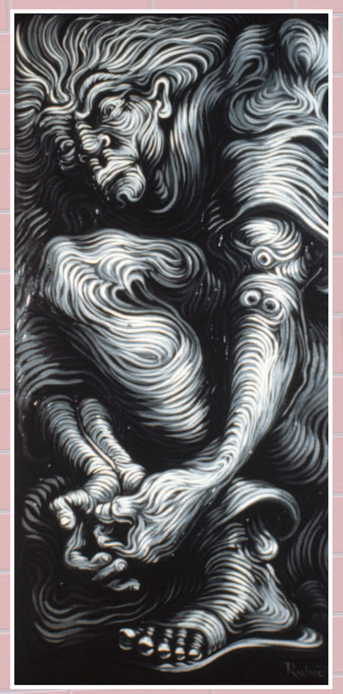
El torcido, Alex Rubio, 48 x 36 in., 1996 (oil on canvas).

Thematically their work reflects their individual backgrounds and ages as well as their experiences with the city.