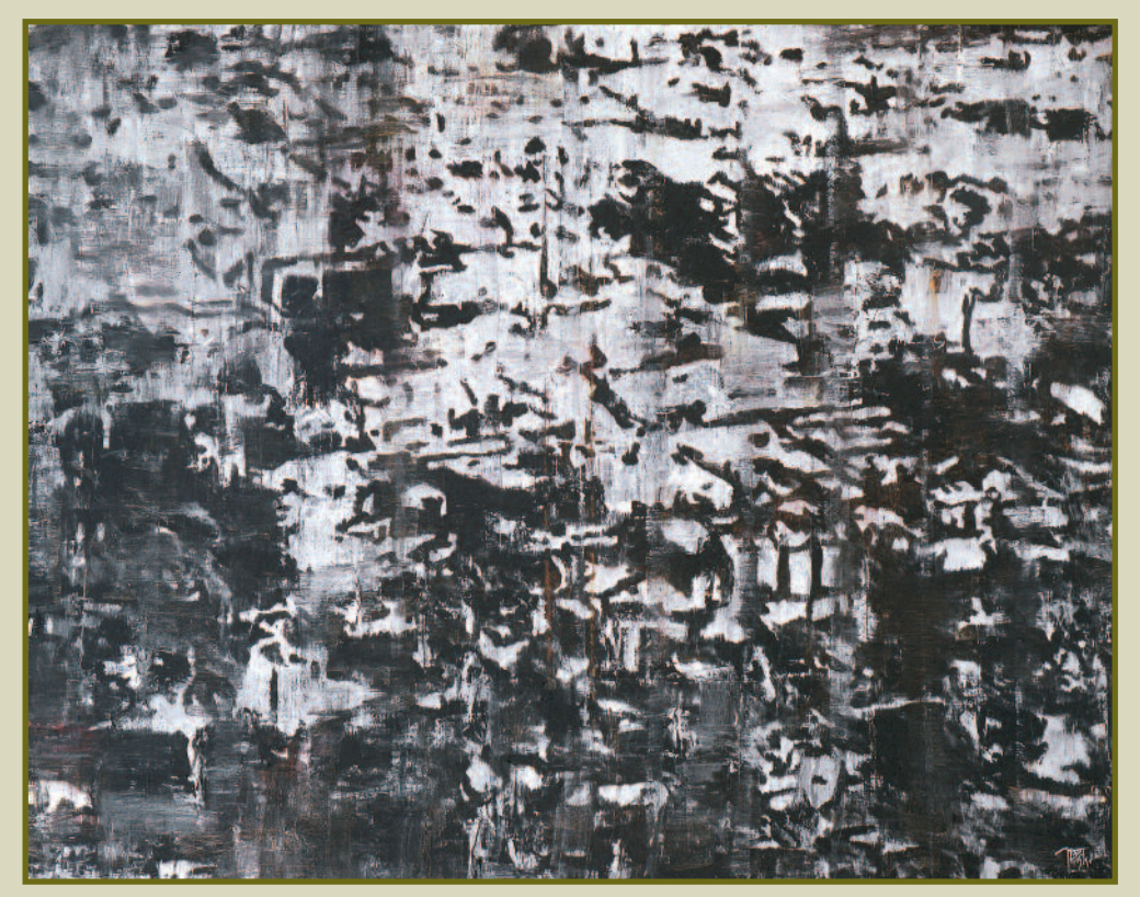
José Castro Leñero, Terminal City, 80 x 100 cm, 2002 (oil and encaustic on canvas).