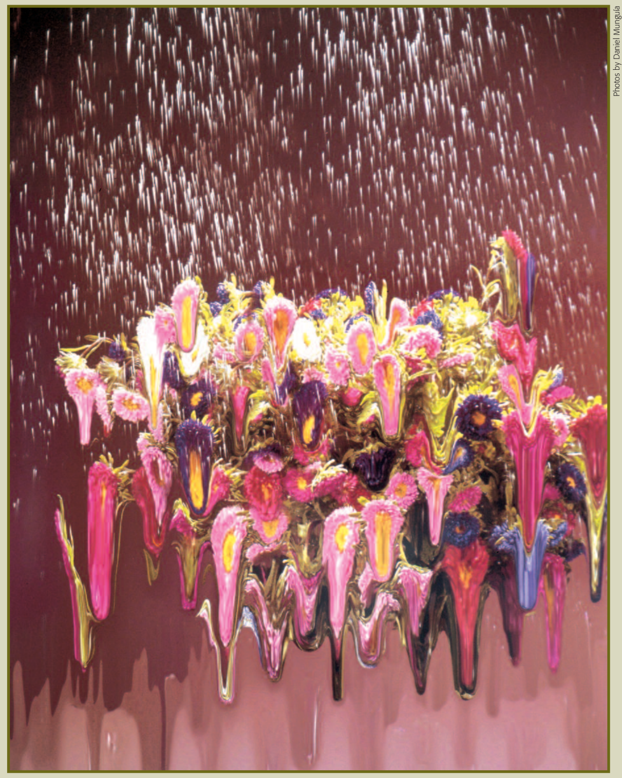
Francisco Macías, Acid Rain, 100 x 80 cm, 2002 (digital impression).