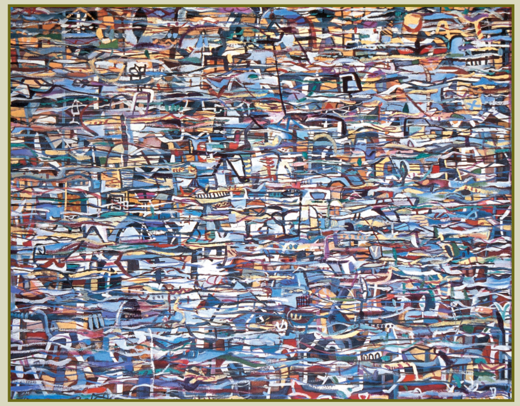
Mario Núnez, Reflections, 80 x 100 cm, 2001 (oil on canvas).