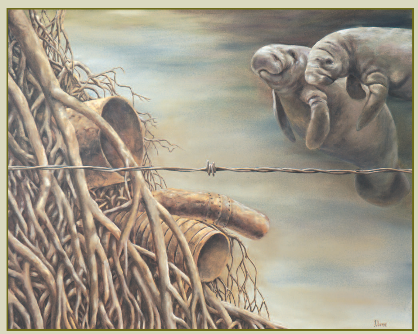
Jorge Luna, Restricted Area, 80 x 100 cm, 2002 (oil on canvas).

Ecological balance —not only in Mexico, but worldwide— is perpetually threatened by the actions of Man.