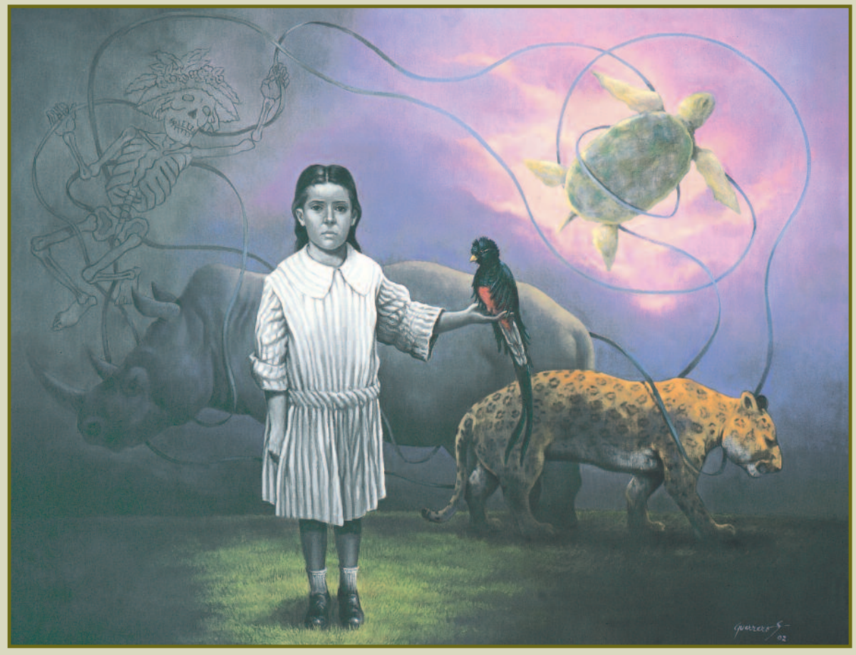
Gilberto Guerrero, And the Catrina Skeleton Went Fishing..., 80 x 100 cm, 2002 (oil on canvas).