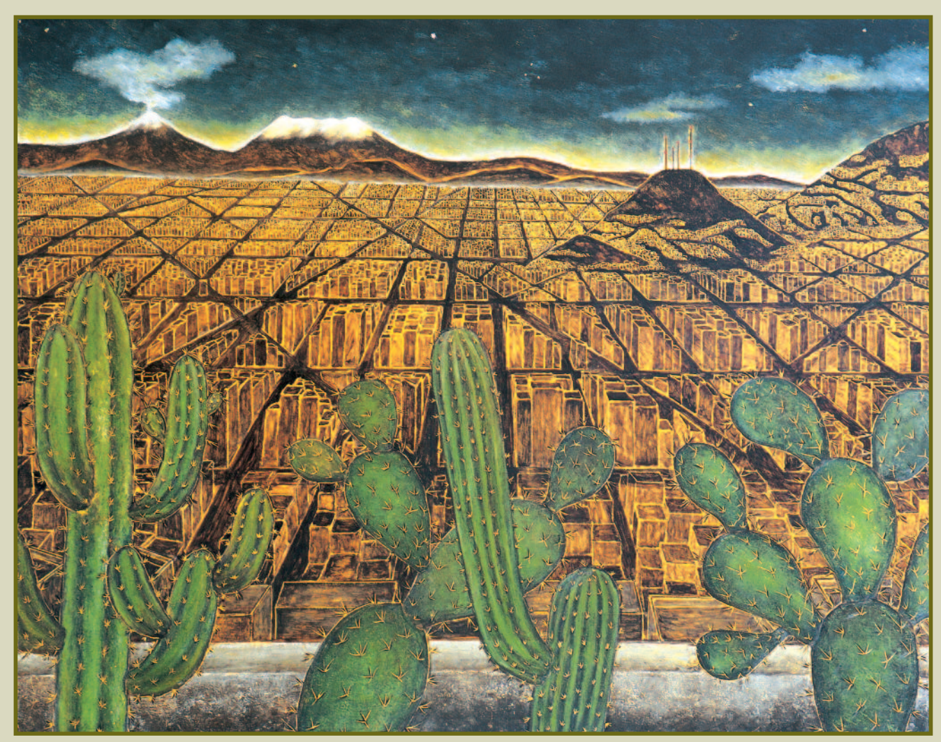
Laura Quintanilla, Valley of Mexico, 80 x 100 cm, 2002 (encaustic on canvas).

Art can also be the instrument in a cause by prompting in its viewer a favorable or unfavorable reaction to a given event or fact.