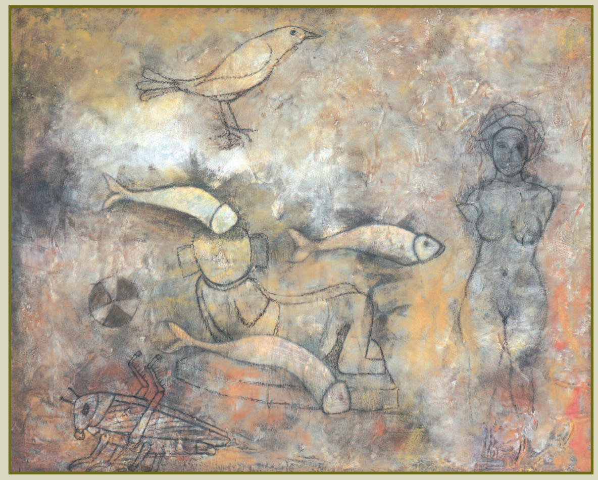
Guillermo Estrada, Memories, 81 x 100 cm, 2002 (acrylic on canvas).

Through their work, our contemporary artists offer ethical and aesthetic testimony to the ecological maelstrom and make a silent call to action.