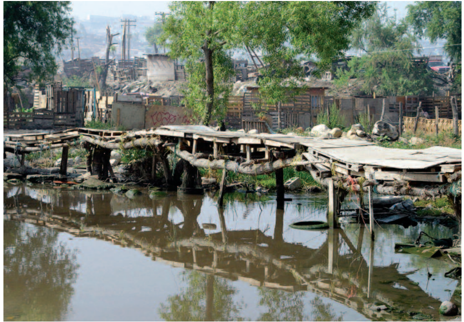
▲ Entrance to Nueva Esperanza shantytown, 2005 (digital photography).

You cannot go through the city without thinking about it. This chaotic, intense urbanization is what enriches the experience of its being this city and no other.