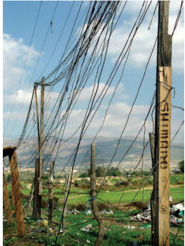
▼ Syphoning off electricity, 2005 (digital photography).

On one of my “trips” through the city, I discovered a shantytown called Nueva Esperanza (New Hope); from the government’s point of view, it is illegal. This shantytown was born because of the constant arrival of migrants mainly from Chiapas and Veracruz, but it is also home to people born in Tijuana who have settled in the bed of the Alamar River and built their houses with materials they have collected from the area in the best of cases, or purchased in the market that sells waste materials.