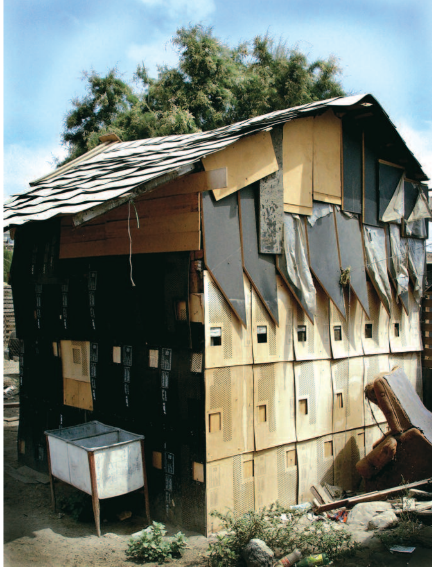
▲ House made with the backs of television sets, 2005 (digital photography).