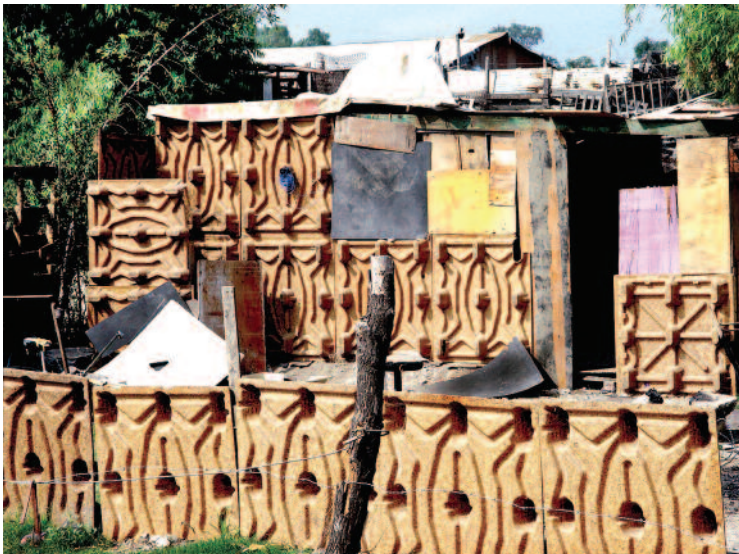
▲ House made with platforms, 2005 (digital photography).

My work is not voyeurism but involvement. In fact, all creation is involvement. I try to apprehend the space and its dynamics using the camera as a tool for intervention. That is why I go through the city losing myself in its geography to prompt encounters that I keep as a record.