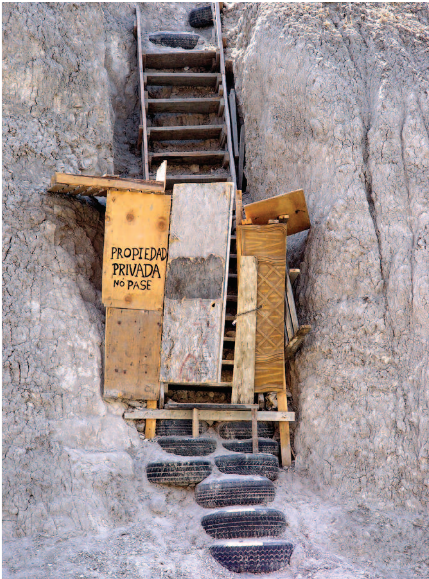
▲ Entrance to a house, 2005 (digital photography).

You cannot go through the city without thinking about it. This chaotic, intense urbanization is what enriches the experience of its being this city and no other. It is impossible to deny the complexity of the space and the heterogeneity of Tijuana-borderland. Useless.