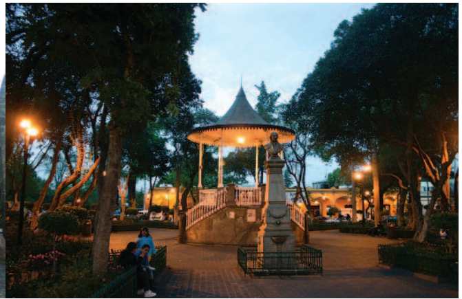
Left: San Pedro Apostle Church. Right: The main plaza's kiosk.

City's Federal District was created and became the country's capital. The state Congress was forced to pick another capital, and it chose San Agustín de las Cuevas, which recovered its indigenous name, Tlalpan, and was ranked as a city. It remained the capital from June 15, 1827 to July 12, 1830, founding educational and economic institutions for the development of the state. But sharp clashes with the federal government because of the cities' geographical proximity forced the change of the capital to Toluca on July 12, 1830.