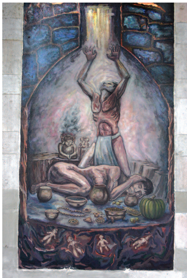
Mural at the Government Palace (detail).

After independence, the criollos replaced the Spaniards as dominant and political matters underwent severe changes. In 1824, the State of Mexico was founded with Mexico City as its capital. But on November 18, Mexico