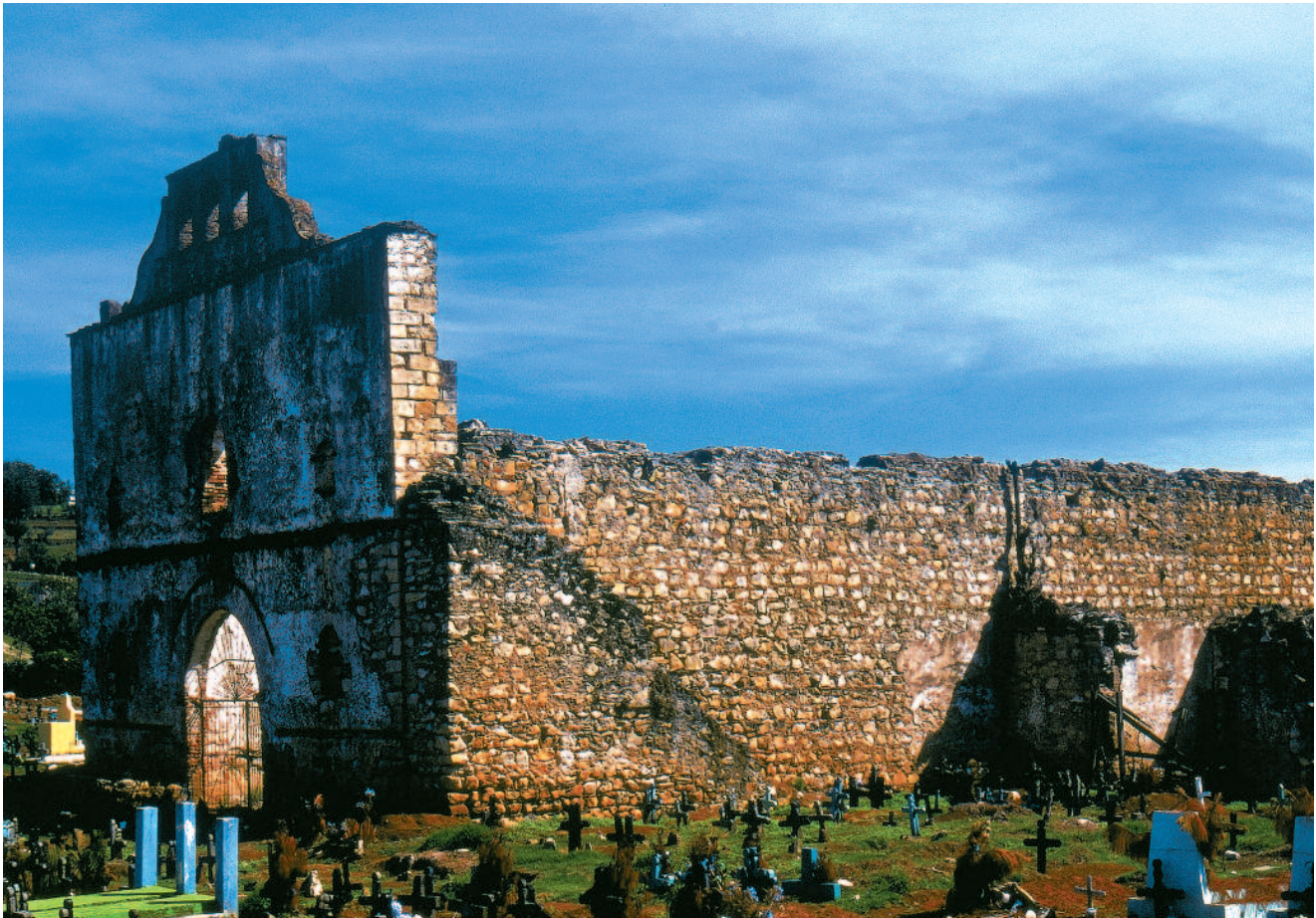
The Old Church of San Juan Chamula next to the cemetery.