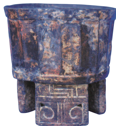
Three-legged Teotihuacan-style vessel with battlement-shaped legs. Early Classical.

SOCONUSCO ARCHAEOLOGICAL MUSEUM 8 AVENIDA NORTE # 24, BETWEEN 1 AND 3 PONIENTE TAPACHULA, CHIAPAS PHONE: (962) 626 4173 OPEN: TUESDAY TO SUNDAY, FROM 10:00 A.M. TO 5:00 P.M.