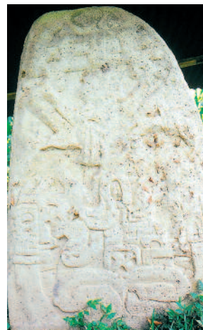
Stelae 11 found in complex B, Izapa.