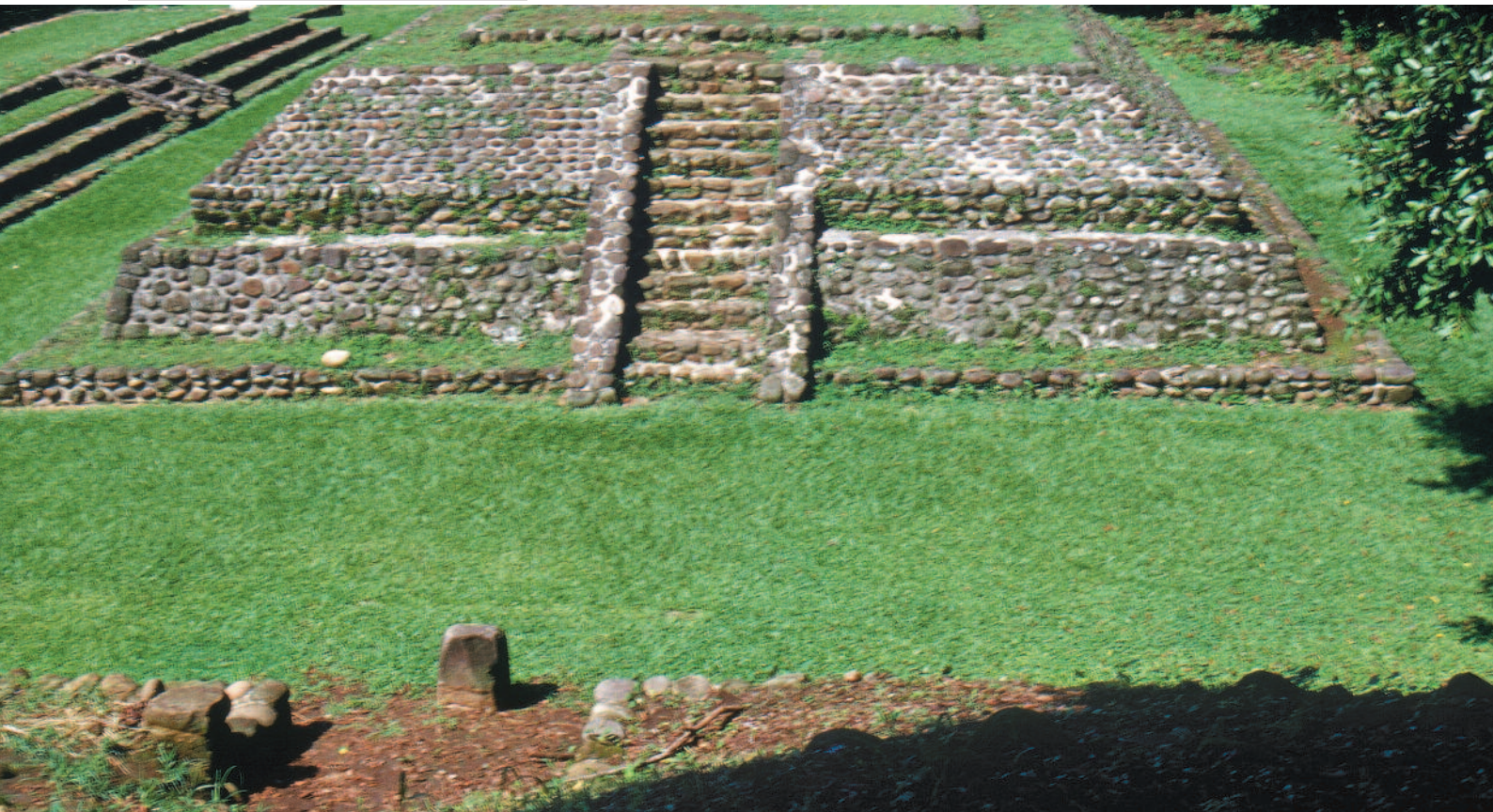
Izapa A archaeological site.