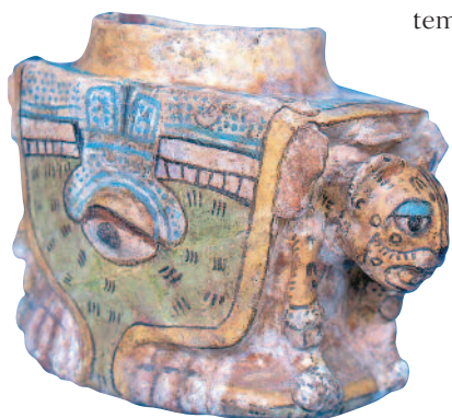
Efigie receptacle with the image of a warrior whose head is the top. Plomiza ceramics. Early Post-classical.

During the late nineteenth and the early twentieth centuries, large, mainly German-owned, haciendas were established in the region. In that same period, large groups of Asian immigrants crossed the Pacific and arrived on the Chiapas coast. Today, the region is a port of entry for many Central American emigrants who for different reasons have settled there. All these actors define the make-up of today's inhabitants of Soconusco. NM