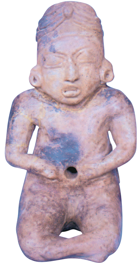
Late Pre-classical figurine from Izapa.

About 1200 B.C., the population of Soconusco received a big cultural impact from the Olmec metropolitan area. The presence of traits of this first great civilization is clear in several objects studied and recovered in the region. One example of this is the pottery and some of the stone sculptures from Izapa on exhibit at the Soconusco Archaeological Museum in Tapachula.