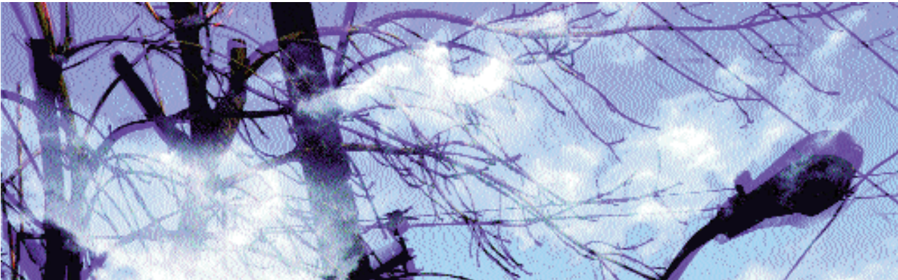
Los Reyes Skies.