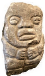
An alux .