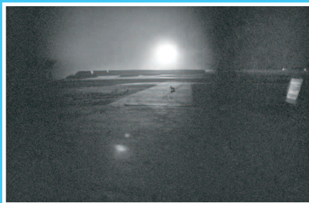
Hare Seen from Mexico, San Diego-Tijuana Friendship Park, 2007.