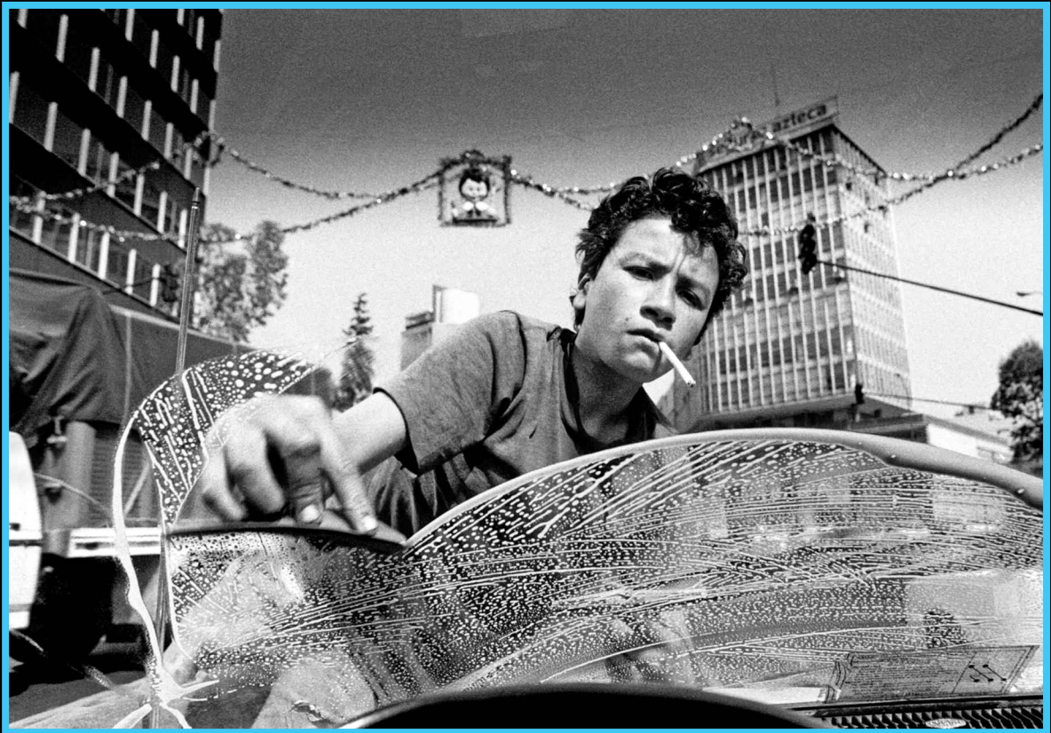
Everyday Life-Windshield Cleaner, Mexico City, 1989.

History of Photography in Mexico. Photos like the one of a jam-packed Mexico City subway detailing anxious hands clinging onto a tube or the one of a migrant in the Zapata Canyon desert are images that speak to unstable circumstances, to despair.