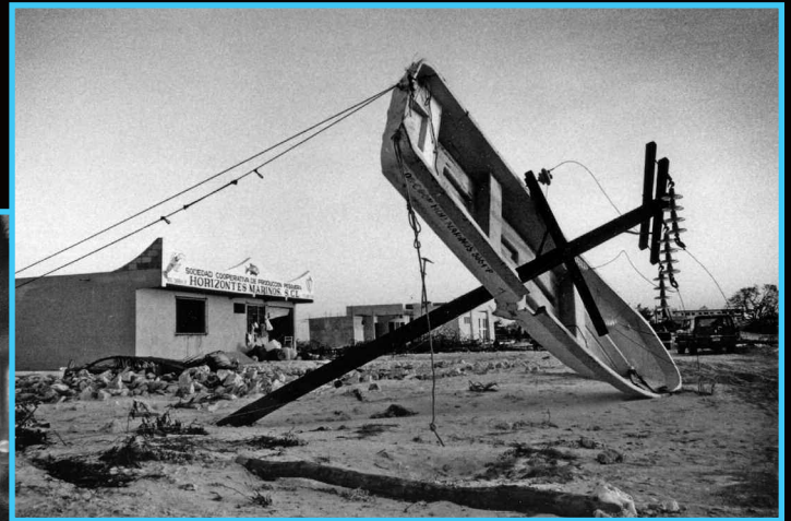
Hurricane Gilbert, Cancún, 1989.