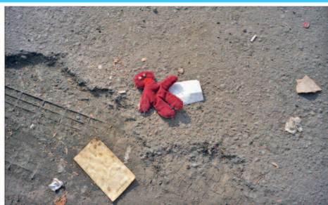
Discarded Stuffed Toy on Ciudad Juárez Street, 2003.