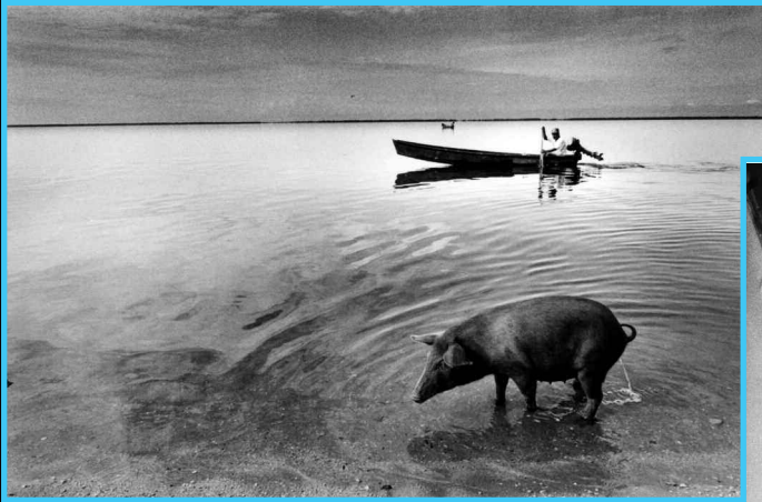
Everyday Life , Three Poles Lagoon, Acapulco, 1993.