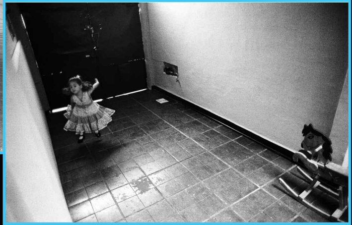
Everyday Life-A Fixed Game , Mexico City, 1996.