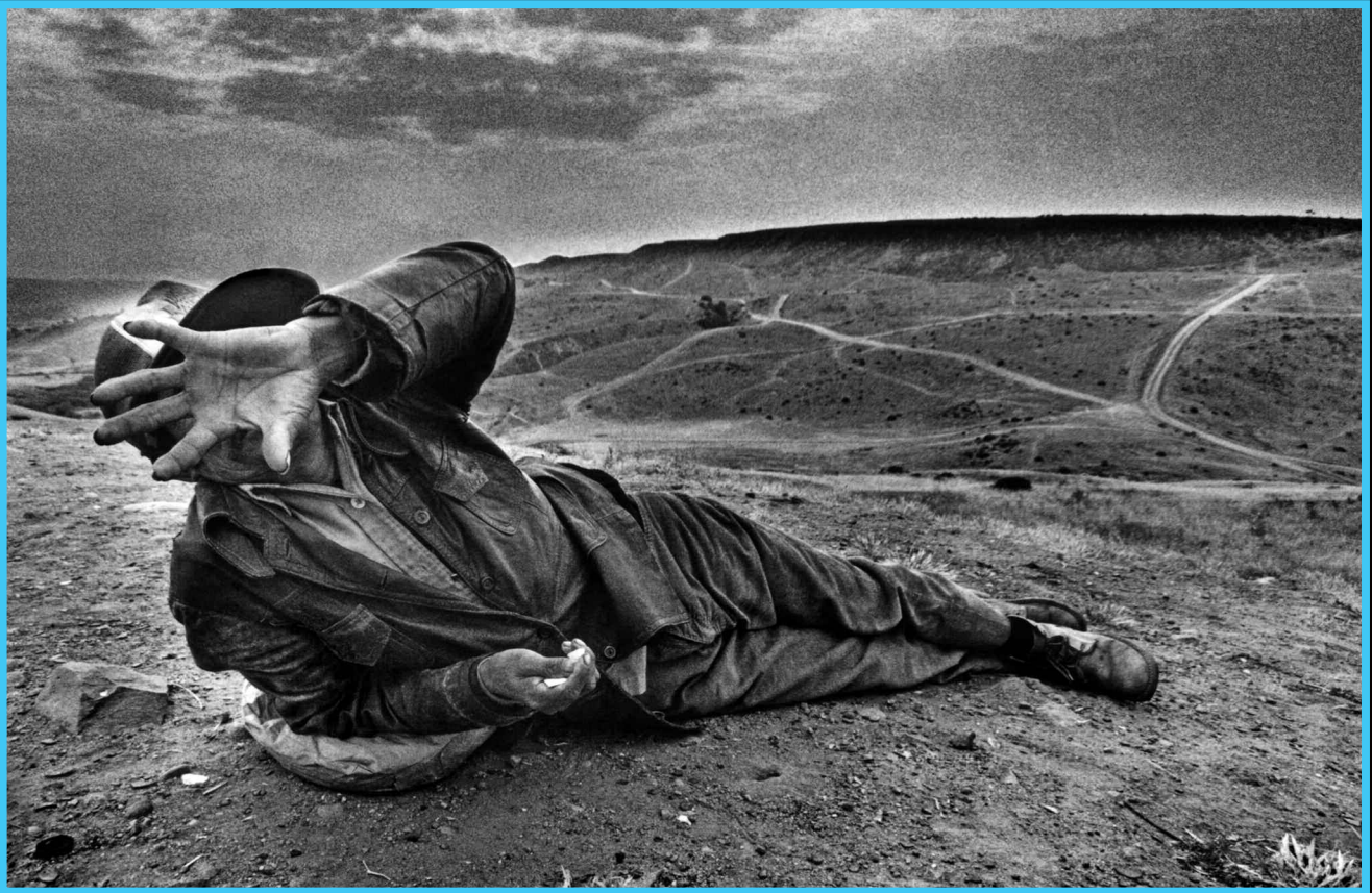
Migrant, Zapata Canyon, Libertad Neighborhood, Tijuana, 1987.