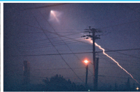
Missile Launched from Vandenburg Air Force Base, California, Seen from Mexico, 1997.