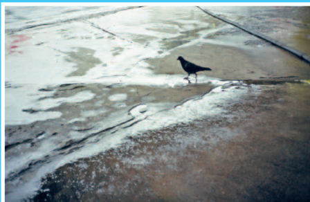
Little Bird Walking Tijuana Streets, 2007.