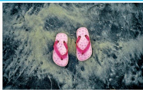
Flip-Flops on Tijuana Beaches, Next to the Border, 2007.