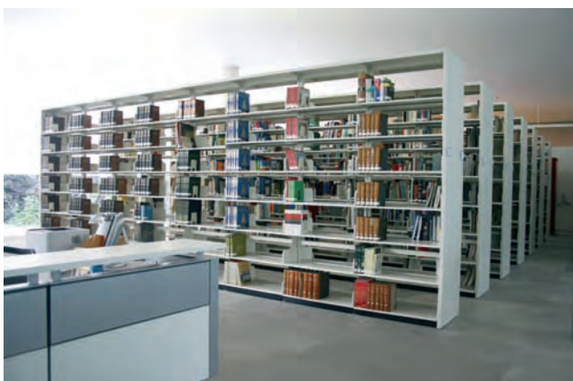
Arkheia Research and Documentation Center.

Museo Universitario de Arte Contemporáneo Insurgentes Sur 3000 Centro Cultural Universitario, Del. Coyoacán, C.P. 04510 Phone: 56 22 69 72 Open Wednesday, Friday and Sunday 10 a.m. to 6 p.m. Thursday and Saturday 12 a.m. to 8 p.m. Mex$40 Sunday, admission is free.