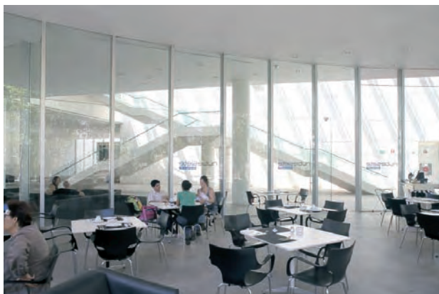
Nube Siete Restaurant.