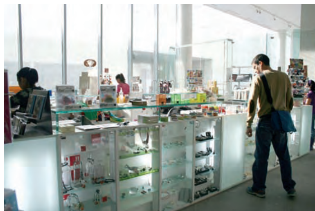
Museum gift shop.