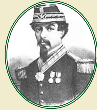
Miguel Miramón , paladin of the Conservative armies and Mexico's youngest president.

The reform ended with two central questions that linked Mexico with the world: the nationalization of all real estate in the hands of the clergy and freedom of religion.