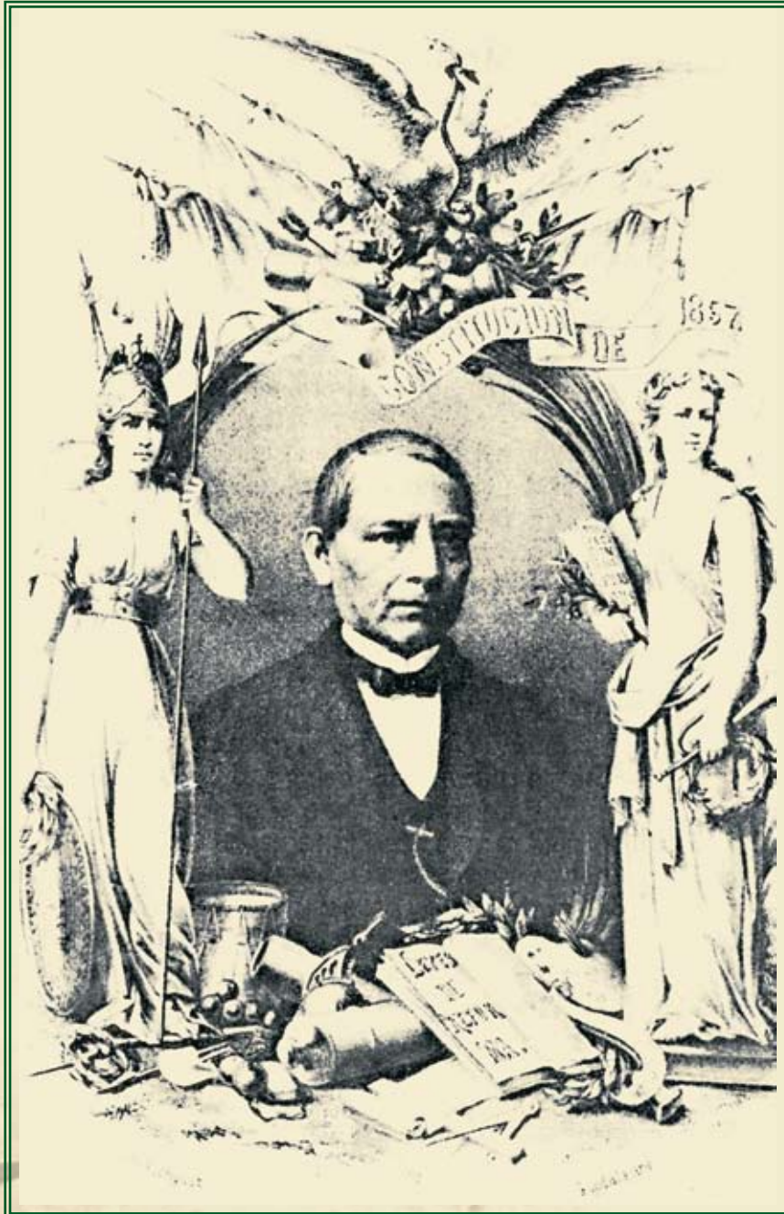
Benito Juárez , defender of the Constitution and the rule of law.