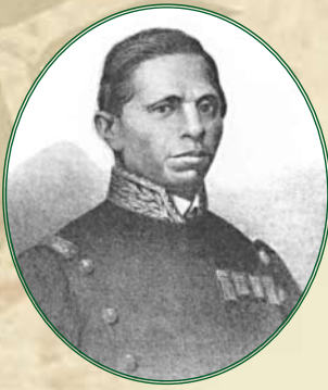
Tomás Mejía , the most fervent defender of the Conservative cause.