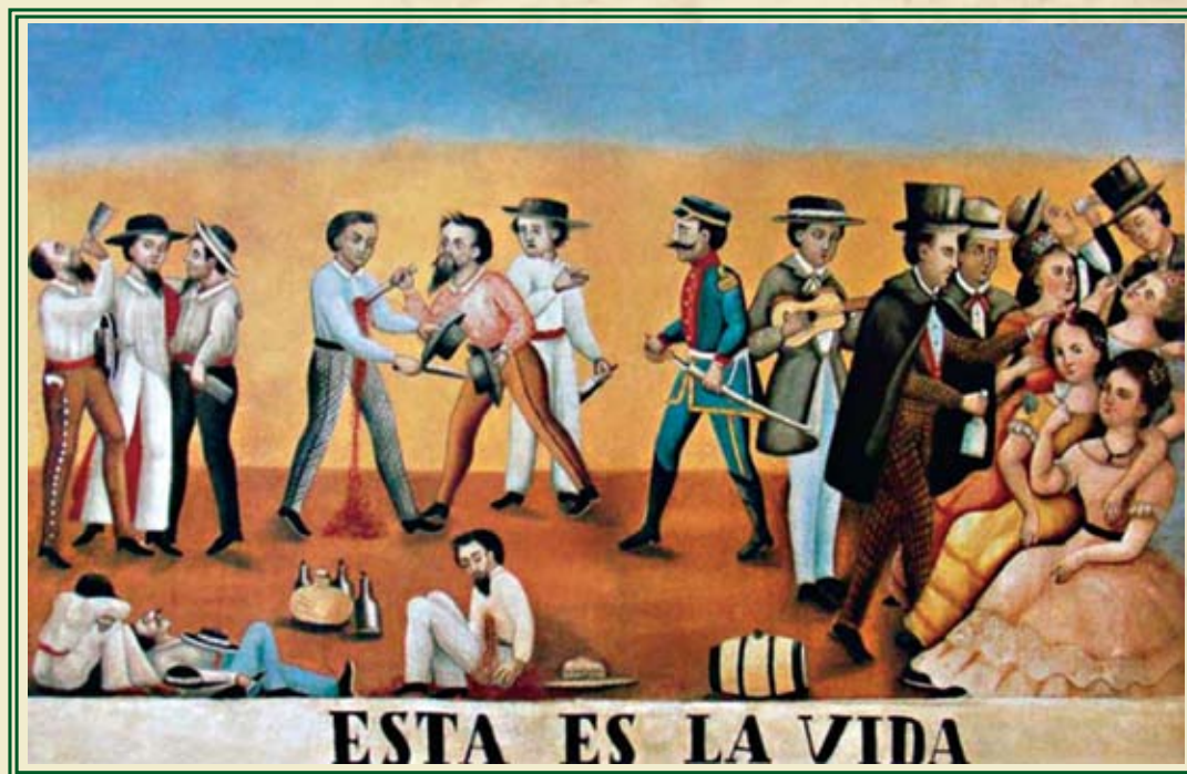
This Is the Life , anonymous, nineteenth century. Violence, drinking, and courtship among Mexicans.

The War of the Reform (also called the Three Years' War, since it lasted from January 1858 to December 1860), a conflict that could have lasted until December 1861, had several characteristics that made it different from the flood of “revolutions” that Mexico had experienced since 1829. First, from the beginning, the rebels based their power in Mexico City, and second, the representatives of the European powers gave both the Félix Zuloaga administration and the later one headed by Miguel Miramón diplomatic recognition. In contrast, the liberal regime established in Veracruz received recognition and naval back-up from the United States.