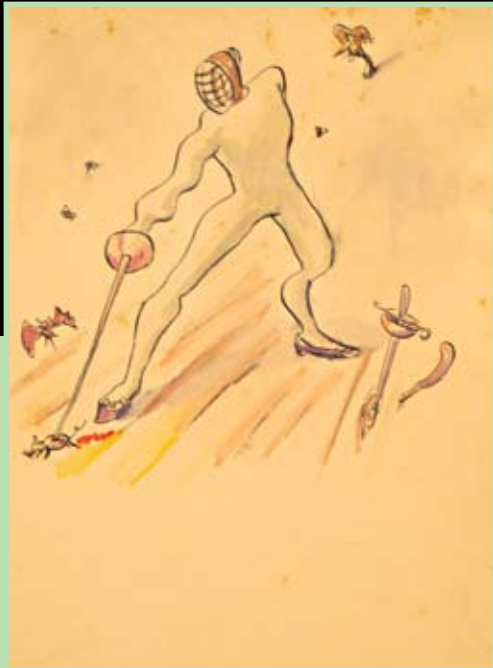
Swordsman , 29.5 x 17.5 cm, 1937 (watercolor on paper).