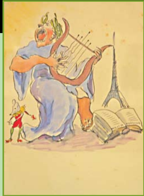
French Minstrel , 29.5 x 17.5 cm, 1937 (watercolor on paper).