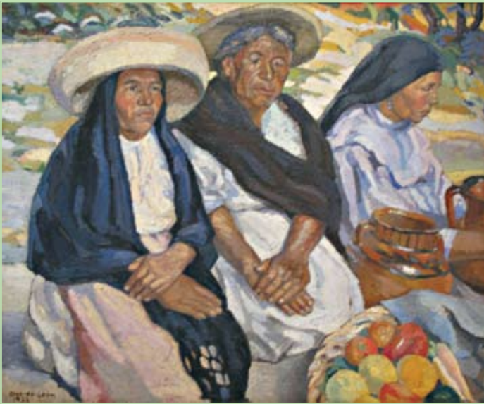
Indians on Market Day , 100 x 122 cm, 1922 (oil on canvas).