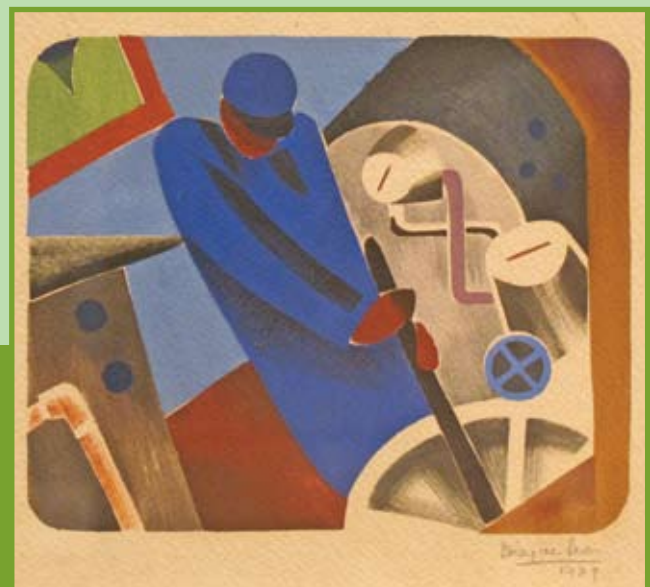
Worker , 21.1 x 14.5 cm, 1929 (stencil).

All the works in the show are linked; the interconnection among them can be divined in the topics Díaz de León used to cover using different techniques.