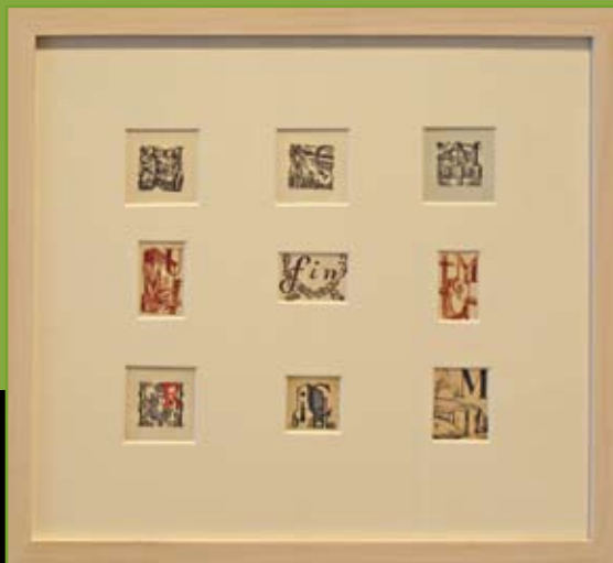
Vignettes and large ornamental initials.