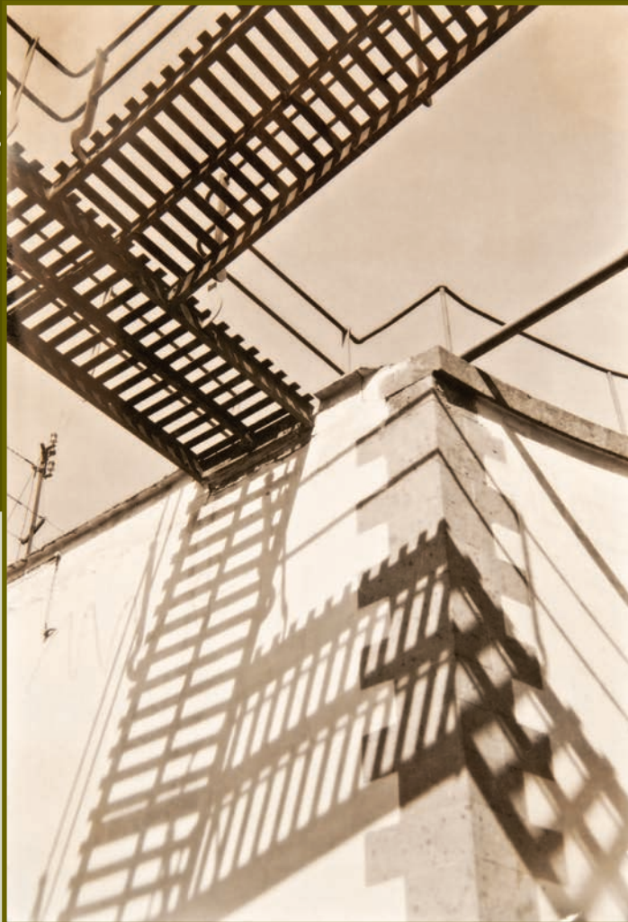
Agustín Jiménez Espinosa, untitled, from the "Tolteca" series, 1931 (silver on gelatin).