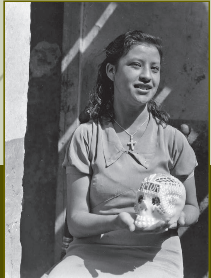
Manuel Álvarez Bravo, The Day of the Dead , ca. 1930 (silver on gelatin).

“The domain of photography as an art is no different from that of poetry: the untouchable and the imaginary. But revealed, and, in a phrase, filtered by what is seen.” Octavio Paz