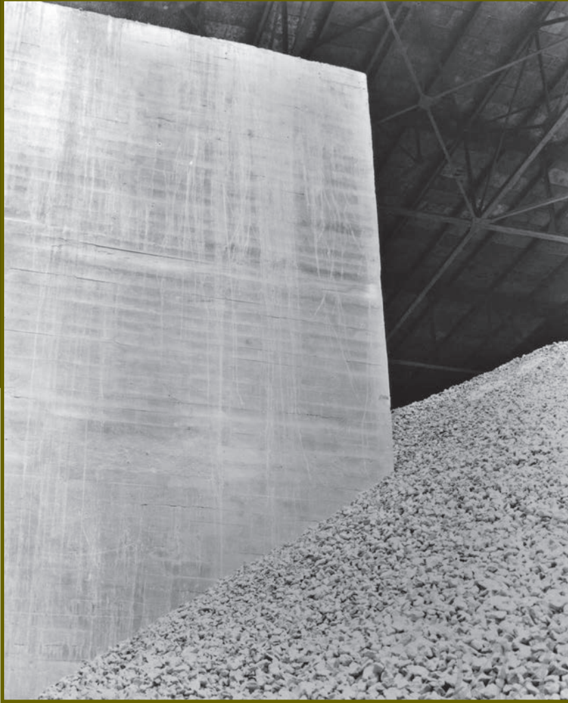
Manuel Álvarez Bravo, Triptych Cement 2 (La Tolteca) , ca. 1931 (silver on gelatin).