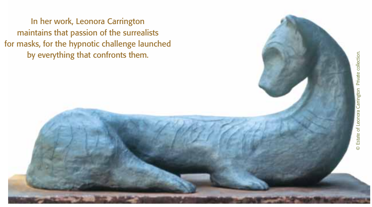
Monsieur, 31 x 62 x 23 cm, 1994 (bronze).

Lion Moon, 62 x 63.5 x 10 cm, 1995 (bronze).