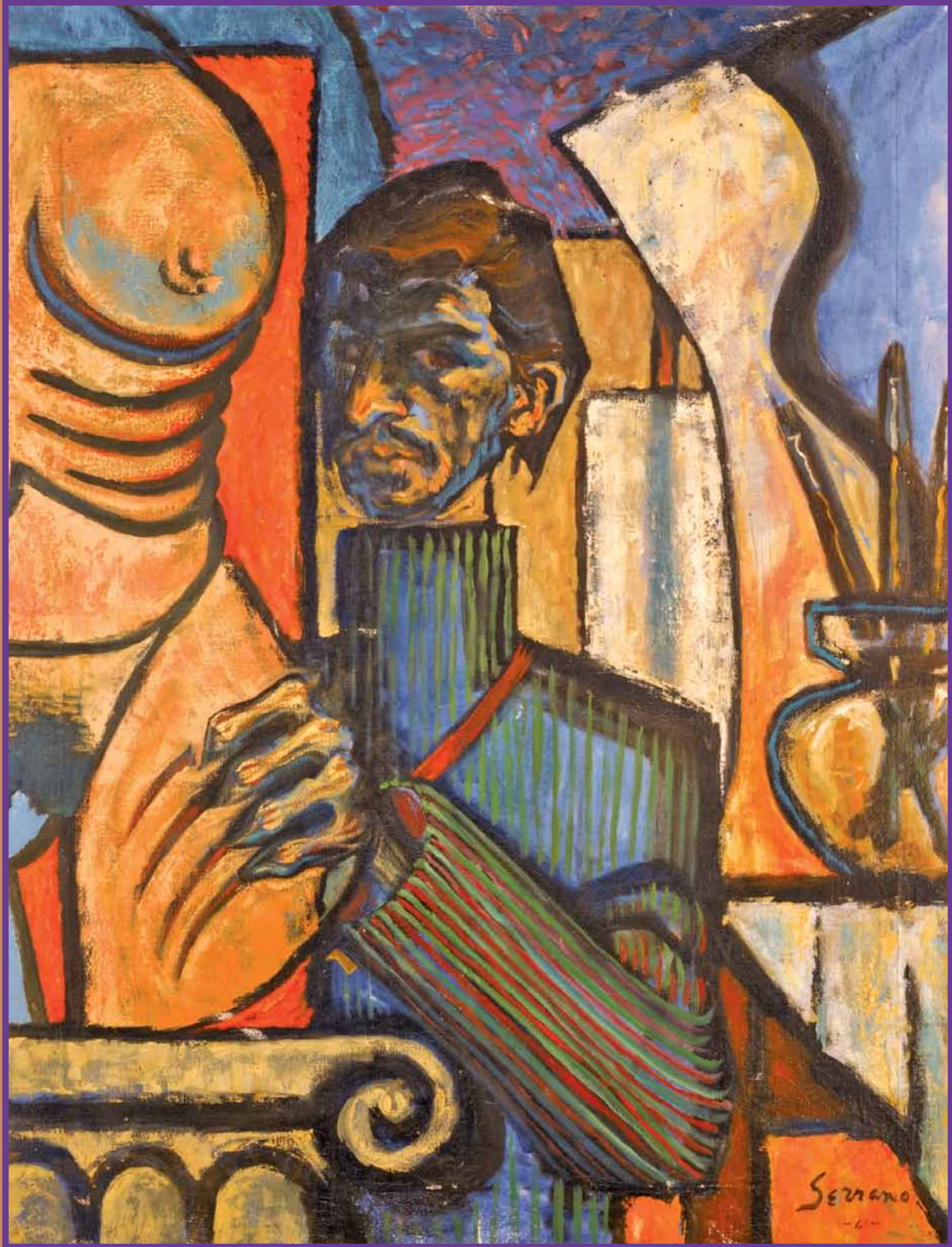
▲ Self-portrait, 87 x 67 cm, 1961 (oil on canvas). Serrano Banuet Family Collection.