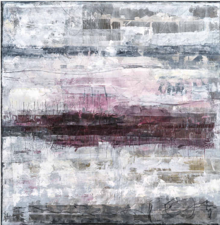
◀ Perhaps Everything Is Wanted , 140 x 140 cm, 2016 (oil on linen).

I see in the art of Virginia Chévez the primordial clay of an idiophone, a unique instrument with a sound of its own.