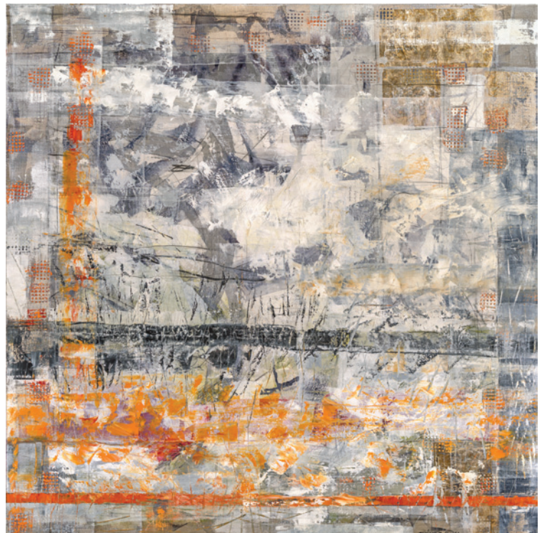
Deep Is the Air , 140 x 140 cm, ▶ 2016 (oil on linen).

I see in the art of Virginia Chévez the primordial clay of an idiophone, a unique instrument with a sound of its own.