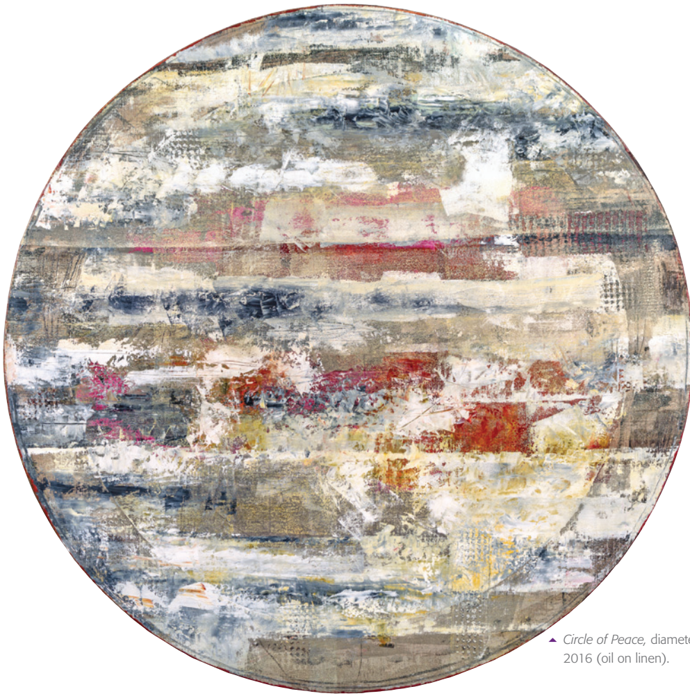
▲ Circle of Peace , diameter 90 cm, 2016 (oil on linen).