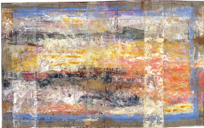
◀ Waves , 68 x 110 cm, 2016 (oil on linen, wood).

Does the artist sustain this event born of canvas, this emblem that an embroidery needle has perforated to leave its mark, a metaphor that multiplies its meanings? "The art of oil painting— / Daubs fixed on canvas—is a paltry thing/