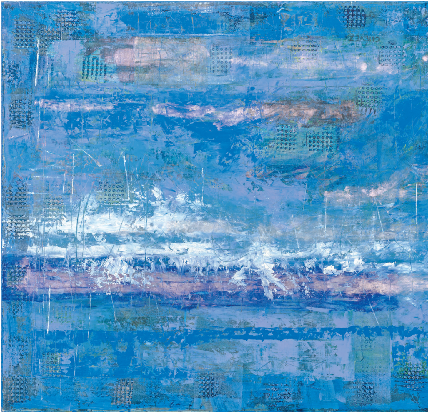
▲ As the Stars Rise , 80 x 170 cm, 2016 (oil on linen).