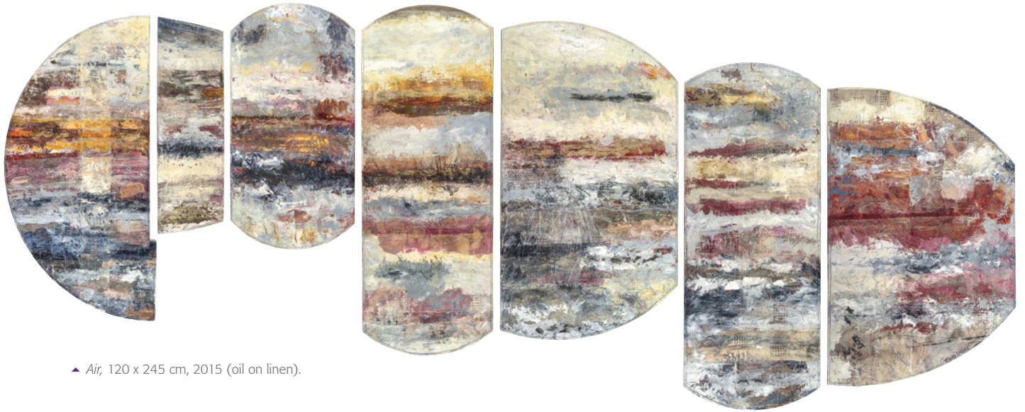
▲ Air , 120 x 245 cm, 2015 (oil on linen).

A voice is hidden somewhere in the wings of raw material. It is never satisfied. It seeks itself in a grayish yes, in a blackened no of its own nights, its own deaths.