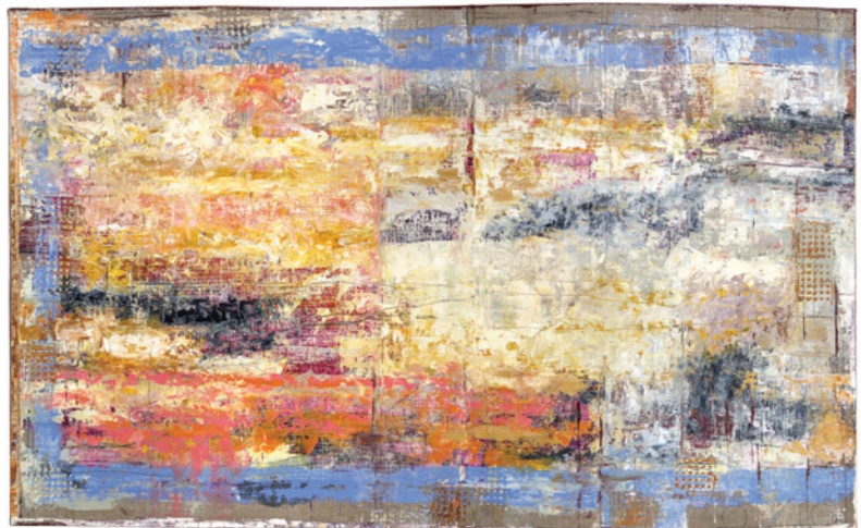
Waves 2 , 68 x 110 cm, 2016 ▶ (oil on linen, wood).