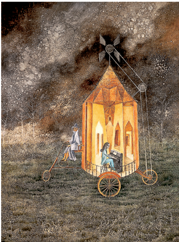
▲ Remedios Varo, Roma Caravan , 1955 (oil on Masonite).

Like in the Julio Cortázar short story "Axolotl," in which the protagonist goes for interminable afternoons to watch