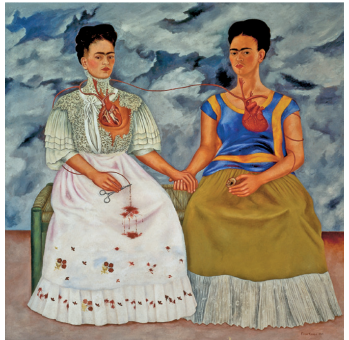
▲ Frida Kahlo, The Two Fridas , 170 x 170 cm, 1939 (oil on canvas).

Far from an immovable history of art, the museum is a laboratory of narratives.