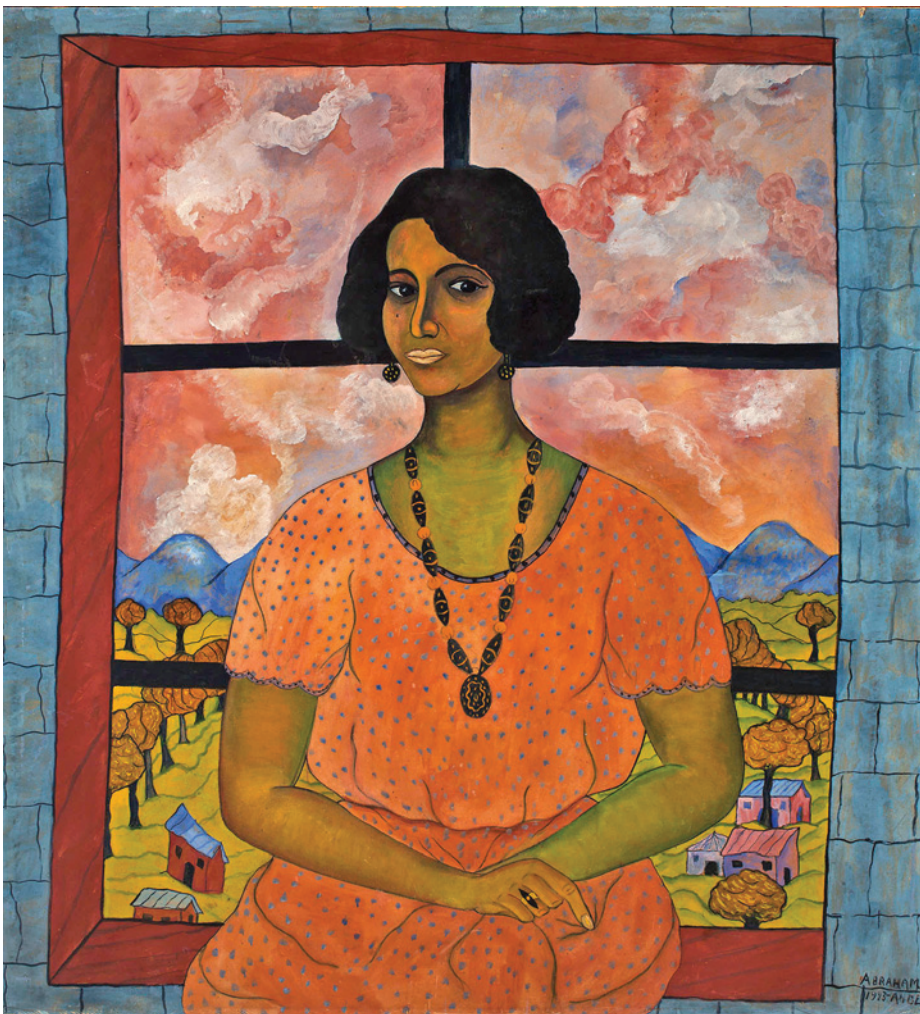
◀ Abraham Ángel Card Valdés, The Girl in the Window .

The Modern Art Museum is facing the challenge of continuing to offer novel perspectives about its collections and to be a space for dialogue about the artistic production of different eras.