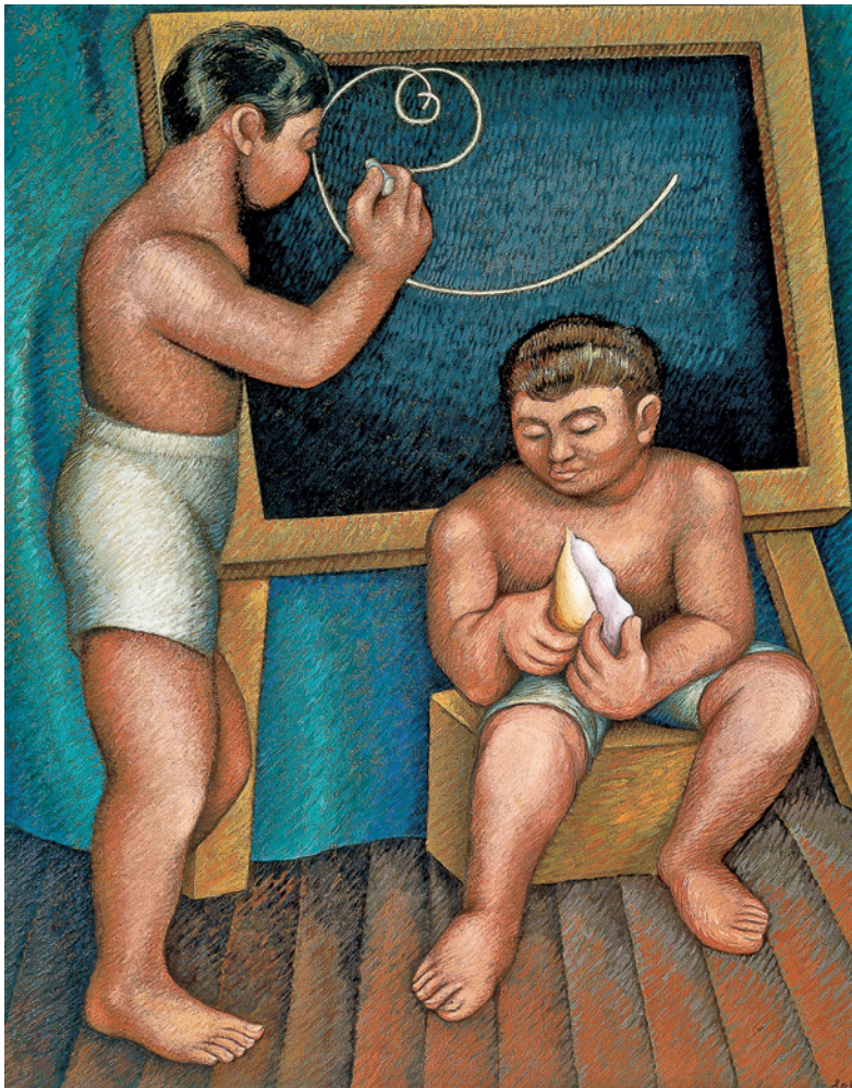
◀ Agustín Lazo, At School (Poetry 1) , 1943.

Parallel to artistic practices no longer being conceived as uniform, chronological movements, in the last analysis, the discrepancies in the museum's collections indicate a process of institutional, social, and political transformations. This process at the same time reflects the interests of different leaderships, the changes in Mexican art, and the reconceptualization of an institutional cultural infrastructure after the turn of the new century, a change whose dimension is barely comparable to the one that the MAM was a part of in the 1960s.