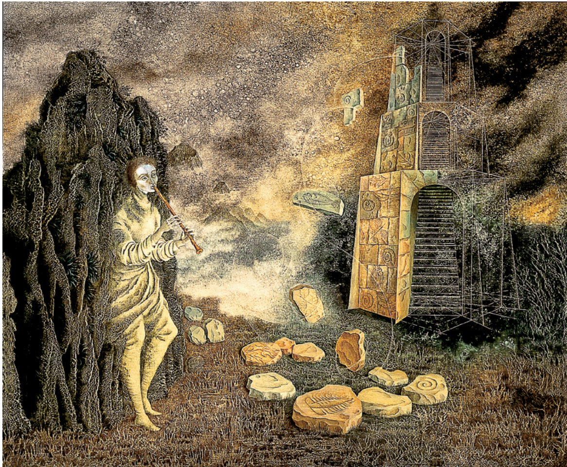
▲ Remedios Varo, The Flautist , 76.5 x 63 cm (oil and mother of pearl incusted on Masonite).

eting. More than 350 very important works have come from the ateliers of artists like Ángel Zárraga, Gerardo Murillo (Dr. Atl), Roberto Montenegro, Diego Rivera, David Alfaro Siqueiros, José Clemente Orozco, Frida Kahlo, María Izquierdo, and Rufino Tamayo. We cannot neglect to mention the photographic work by Manuel Álvarez Bravo, Tina Modotti, and Edward Weston either. Despite this, it is even more important to point to the close relationship between the museum space and the artistic practices carried out after it was created.