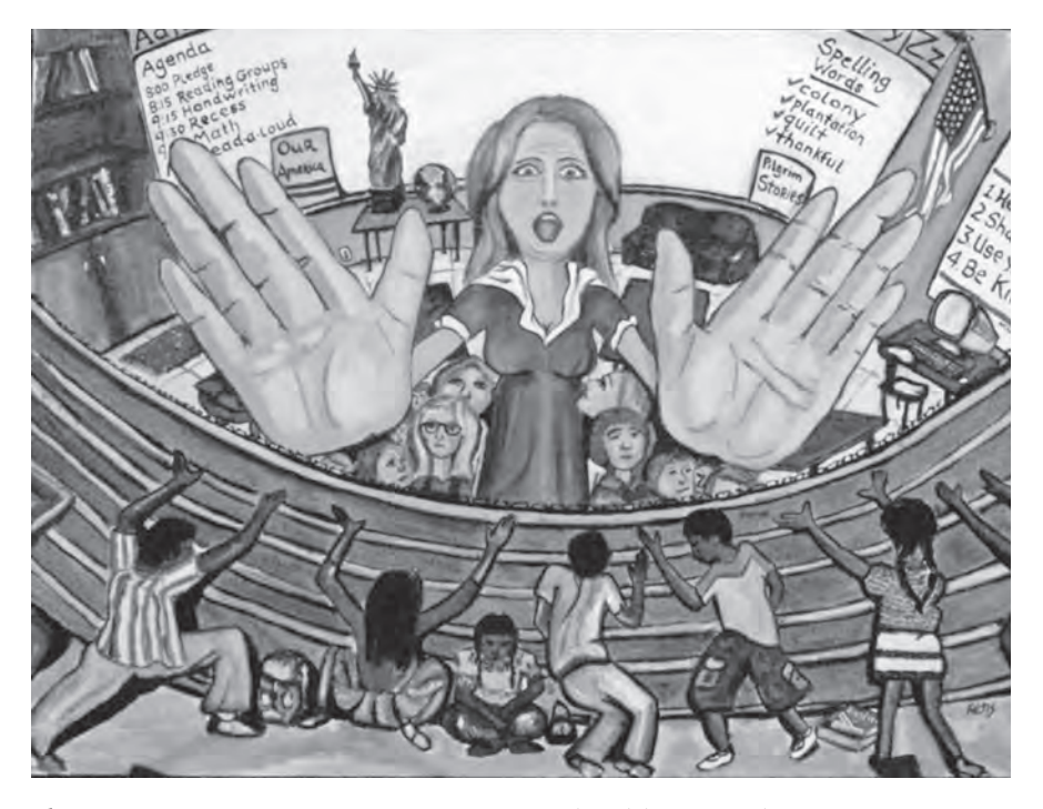
Chris Faltis, No More Borders vs. No More Immigrants (2008) (Faltis, 2012).

Intertwined with critical discourse analysis, critical race theory (CRT), developed through the work of U.S. legal scholars, has been applied to educational research as well as other fields. It articulates a set of interrelated beliefs about the significance of race and racism as it operates in contemporary educational institutions and policies (Ladson-Billings and Tate, 1995; Ladson-Billings, 2005; Tate, 2005). CRT scholars such as Derrick Bell (1992) explore the multiple ways that U.S. law, politics,