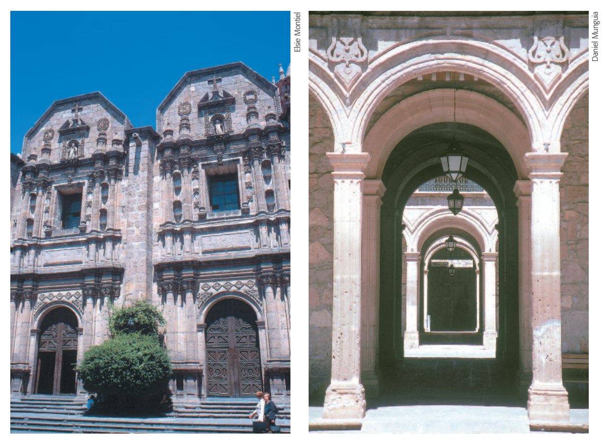
The Church of the Nuns.