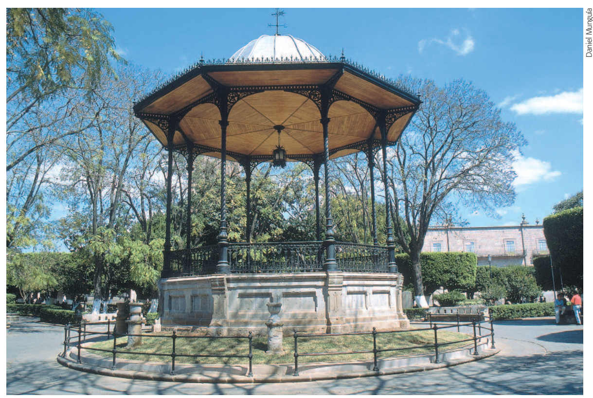
Kiosk in the Plaza of Martyrs.

Its benign climate and fertile soil made it a good place to settle for landed gentry, merchants and the vast clergy, both secular and regular.