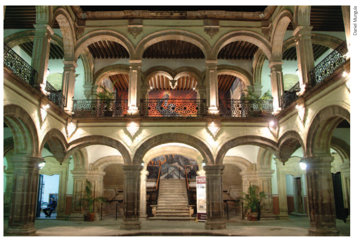
Patio of the Palace of Justice.

In modern times, Morelia has spread outward in all four directions creating neighborhoods that are not very uniform. During its four and a half centuries, its inhabitants have left a mark that, like Penelope's cloth, has been repeatedly woven and unravelled. This imprint in time has been and continues to be the reigning norm for its police