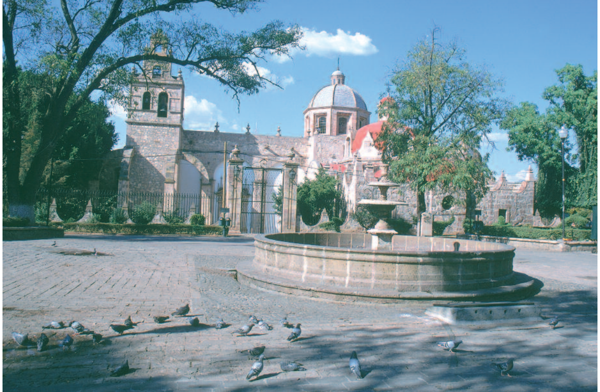
The Melchor Ocampo Plaza. In the background the cathedral.