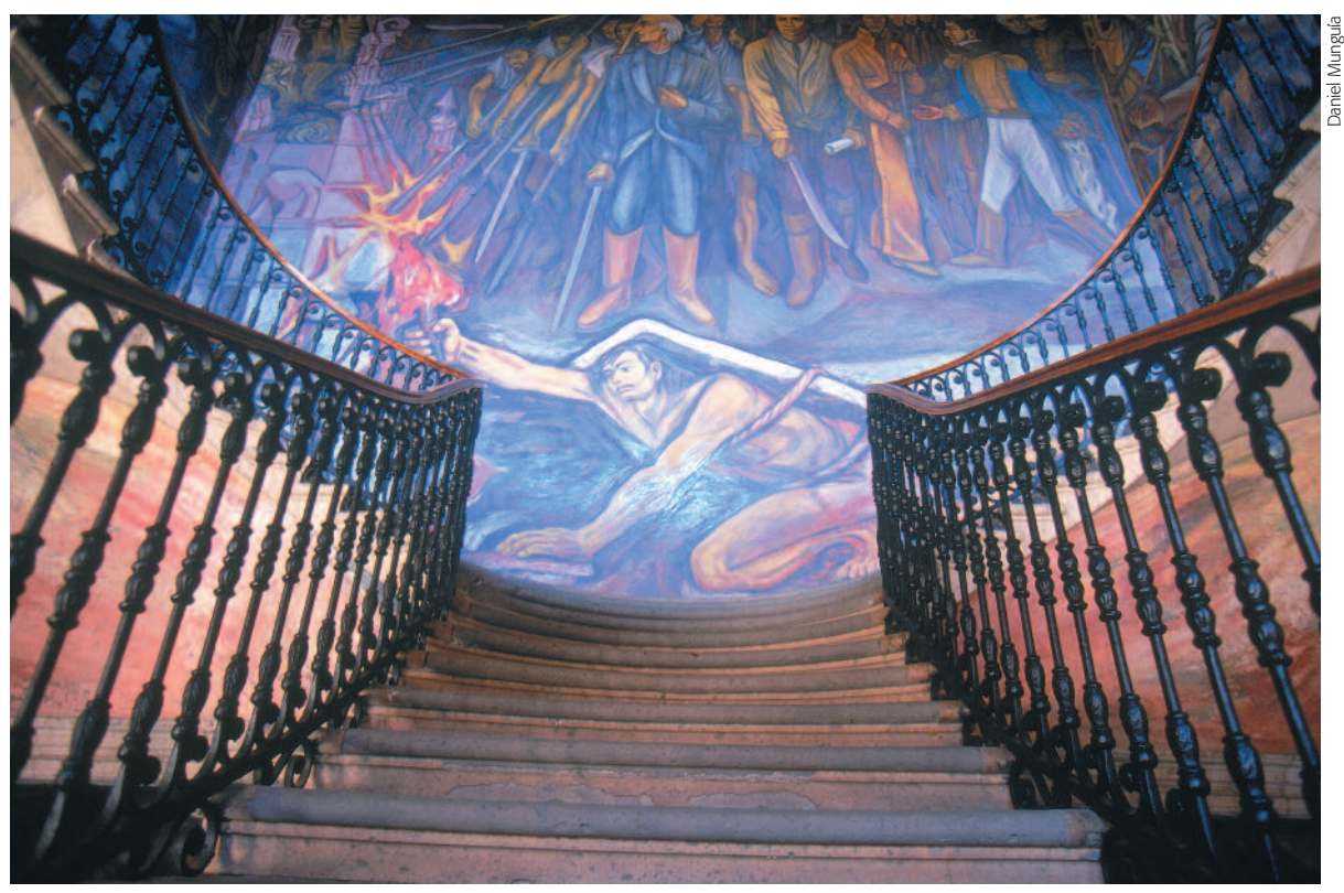
Alfredo Zalce's mural in the Government Palace

Huge mansions, beautiful public buildings, churches and spacious monasteries gave Morelia the look of a distinguished criolla city of exalted lineage.