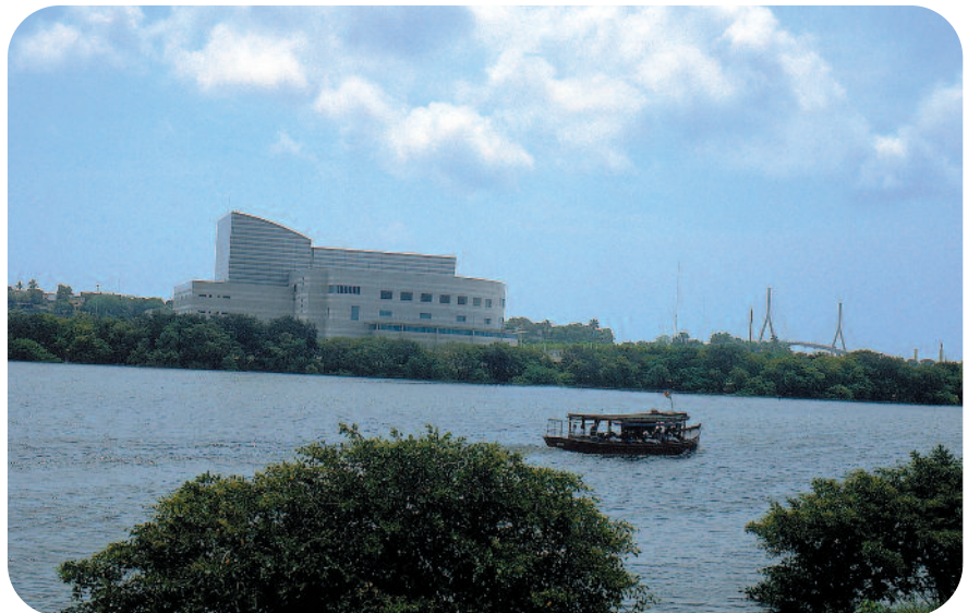
The modern Metropolitan Space Cultural Complex on the shores of the Carpintero Lagoon houses the museum.

Tampico (meaning "place of otters") was one of the old seats of the Huastec culture. In and around the city there are still many remnants of the ancient towns built on the shores of the lagoons and rivers like the Pánuco and the Tame-sí. In the Chairel Lagoon, and in the rest of what is now the state of Tamaulipas, the battle that gave the Spaniards control over the Huasteca region took place.