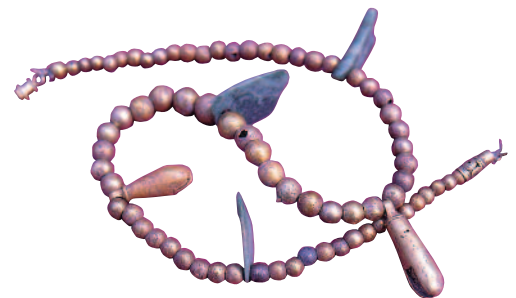
Gold necklace.

THE HUASTEC CULTURE MUSEUM ESPACIO CULTURAL METROPOLITANO BOULEVARD LÓPEZ MATEOS S/N LAGUNA DE CARPINTERO TAMPICO, TAMPS. C.P. 89169 OPEN TUESDAY TO SUNDAY, FROM 10 A.M. TO 6 P.M. PHONE: (833) 210-2217.