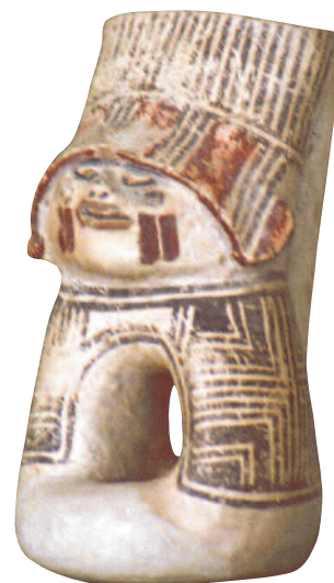
Tancol anthropomorphic vessel.

The art room displays creative and finely honed works including stone sculptures representing gods and ritual and domestic ceramics, toys and musical instruments. Two unique pieces stand out among all the rest: a jointed, bone doll representing a nude woman with a cone-shaped hat, and the exact reproduction of a Huastec sculpture of a priest, the original of which is currently on display in the Louvre after a French merchant living in Tampico took it to France in the late 1800s. Until only a few years