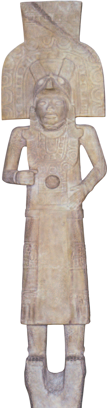
Reproduction of a Huastec priest. The original is currently at the Louvre.

For historical and geographical reasons, Mexico's Northeast, and particularly Tamaulipas, have developed differently from the rest of the country. The lack of dominant cultures with monumental remains had limited both archaeological research and the dissemination of this state's cultural history. Nevertheless, recent archaeological discoveries have sparked the interest of a society that for years has demanded cultural outlets, with the