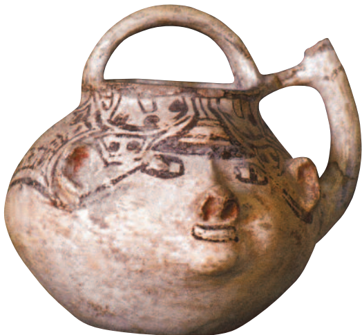
Black on white anthropomorphic vessel.

The central piece in the room of death is the recreation of the high-ground double interment, discovered in 1999.