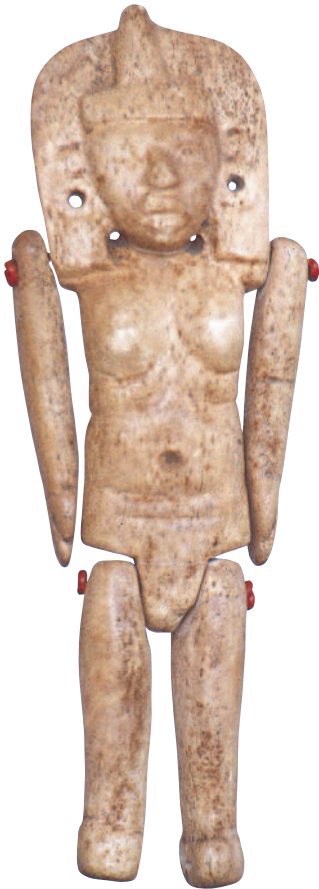
Jointed bone doll.