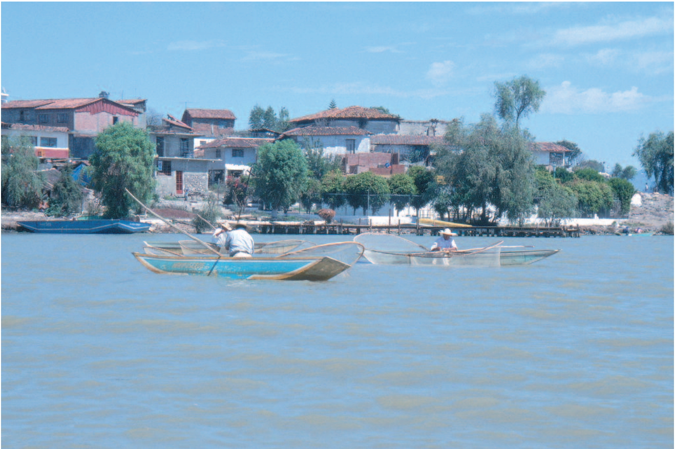
Patzcuaro fishermen in their picturesque boats.

candle light, and because of the techniques used. The project was fascinating, however. Alva de la Canal delighted in discovering the details of the life of Morelos, “the Servant of the Nation,” as he covered 250 square meters of the interior of the statue. He painted 56 panels on five different levels, using mixed techniques with great mastery: frescoes, encaustics and tempera.