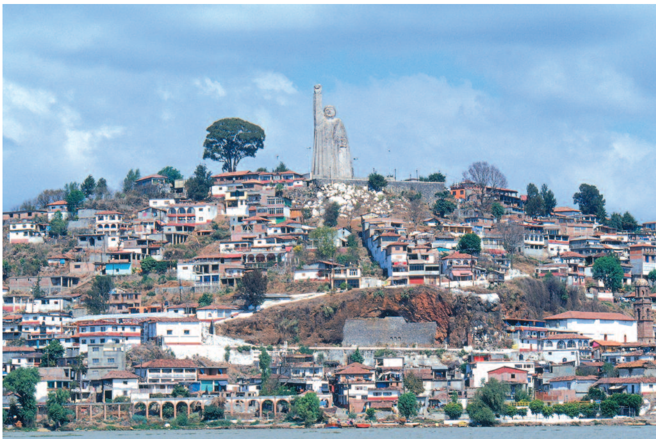
The island of Janitzio.