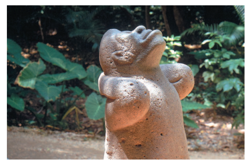
Freestanding sculptures have profound religious meaning.

Considered chronologically, the giant heads demonstrate the Olmecs' genius as sculptors, both because of their mastery of carving techniques in the hard stone and their high artistic quality, and also because of their ideological content. But they did not always achieve their goal: in some cases, such as with Monument 68, when they were just beginning to delineate some of the features, the stone was severely cracked and the work had to be abandoned. The colossal