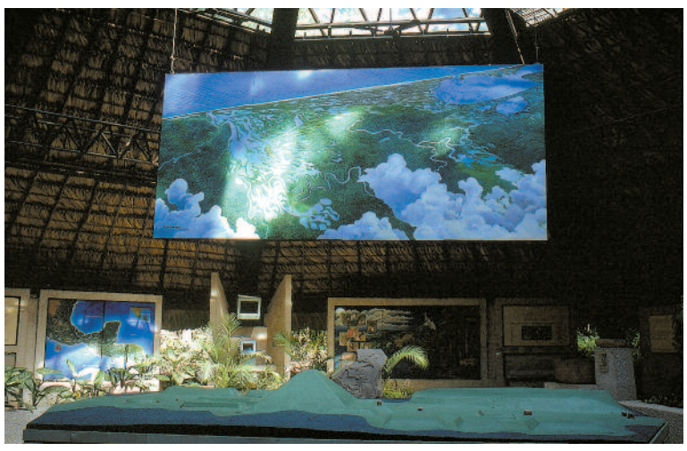
The introductory room with the model of the La Venta site.