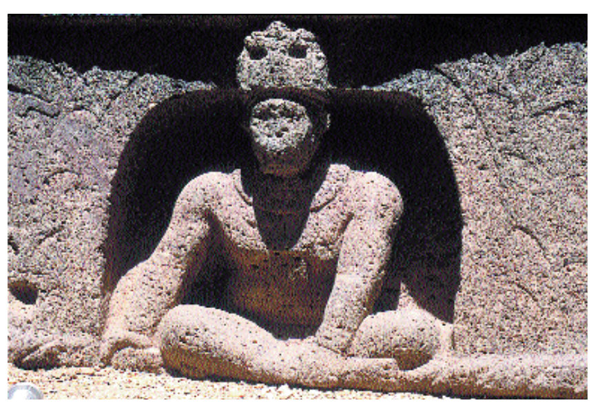
Altars reflect a cosmic discourse.

heads, with their almond-shaped eyes, thick lips and wide, flat noses, are a challenge to interpret. But, is it feasible to think, because of the way they were arranged in the political-religious center's holy ground, that perhaps they represent the protecting ancestors, dead rulers?