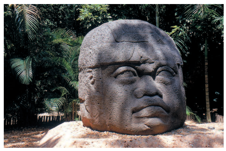
Monument 1, La Venta.

ust by going through the heavy iron railing that leads into the La Venta Museum-Park in Villahermosa, time seems to come to a standstill. Behind us we leave the oppressive deafening noise of modernity. In its place is only the silence of the jungle interrupted by the sharp buzz of thousands of insects, the howl of the spider monkeys, the jaguar's long yawn, the badgers' scampering and the steps of the tepezcuintles (agouti paca) over the withered leaves, accompanied by the song of the birds and the swaying branches of the centuriesold silk-cotton trees, the ceders or the palms. Murmurs with prolonged silences that we are no longer used to, murmurs that guide us through the quiet flow of more than 3,000 years accumulated in the dozens of Olmec sculptures that loom out of the weeds here and there.