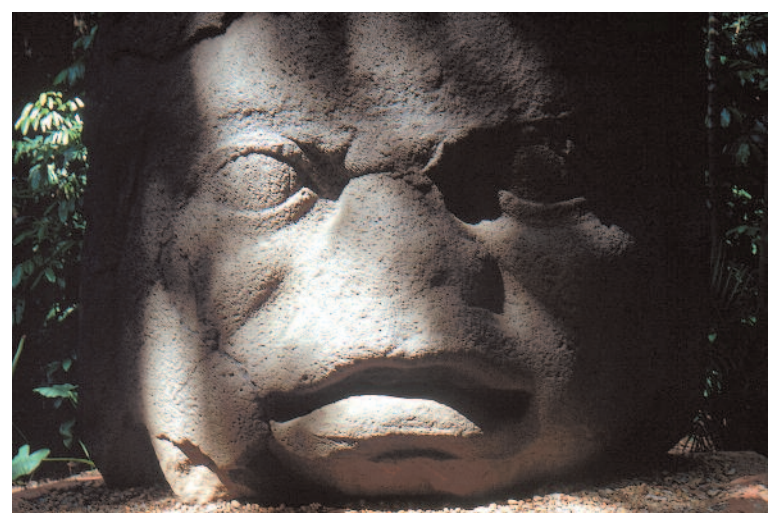
Monument 4, La Venta.