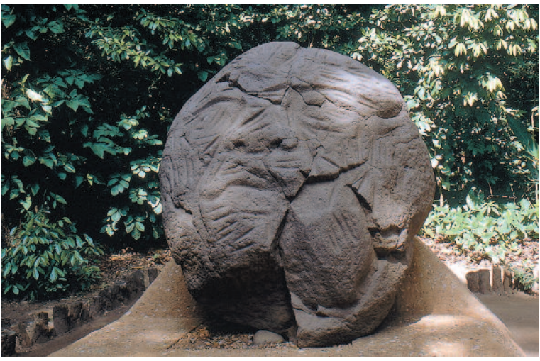
Monument 68. Unfinished head.