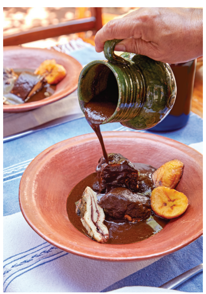
▲ Seven-layer tamale with mole sauce and toasted plantain.