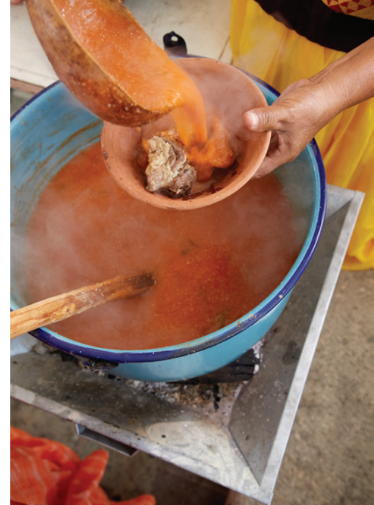
Mole sauce made with toasted maize.

tion of Traditional Cooks. Held in the Oaxacan capital's Dance Plaza in 2017, it was a huge success. One year later, the Second Convention was held with an added "Oaxacan table" where artisans from all over the state offered their wares. A street market or tianguis was also held for local producers to sell their products, accompanied by a convention of 80 traditional cooks that the organization honored with the title Traditional Master Cook of Oaxaca; the group is seeking the state university's seal of approval to issue an official certificate to that effect.